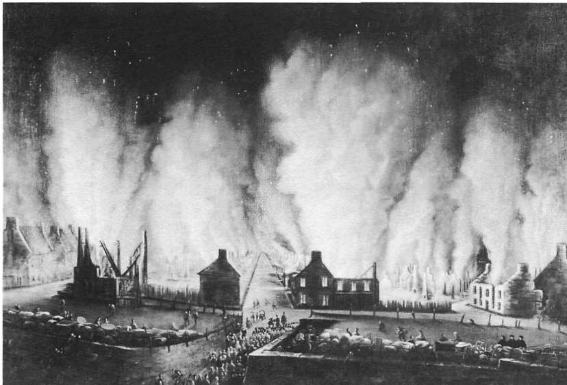
PICTURE 5: Joseph Légaré. L'incendie du quartier Saint-Jean vu vers l'ouest . (Art Gallery of Toronto.)

tent. 10 There also appears to be political meaning in some of his city painting.