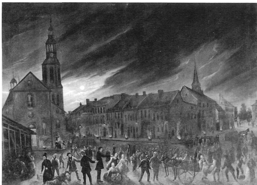
PICTURE 1: Joseph Légaré. Cholera Plague, Quebec. 1832. (National Gallery of Canada, Ottawa. No. 7157).