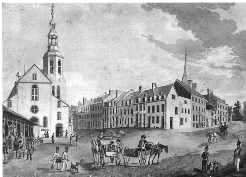
PICTURE 2: Robert Sproule. The Market Place, Upper Town, Quebec, 1830. (McCord Museum, McGill University, Montreal. No. M384). Légaré appears to have based Cholera Plague, Quebec's streetscape on this marketplace watercolour by Sproule.

through investments in Quebec City real estate. (Légaré himself also earned income from property rental).