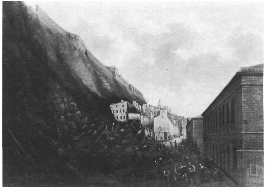
PICTURE 4: Joseph Légaré. Landslide At Cape Diamond (Eboulis du Cap Diamant) . 1841. (Musée du Séminaire de Québec, Québec. No. PC 983.30 R 243. Photographer: Pierre Soulard).