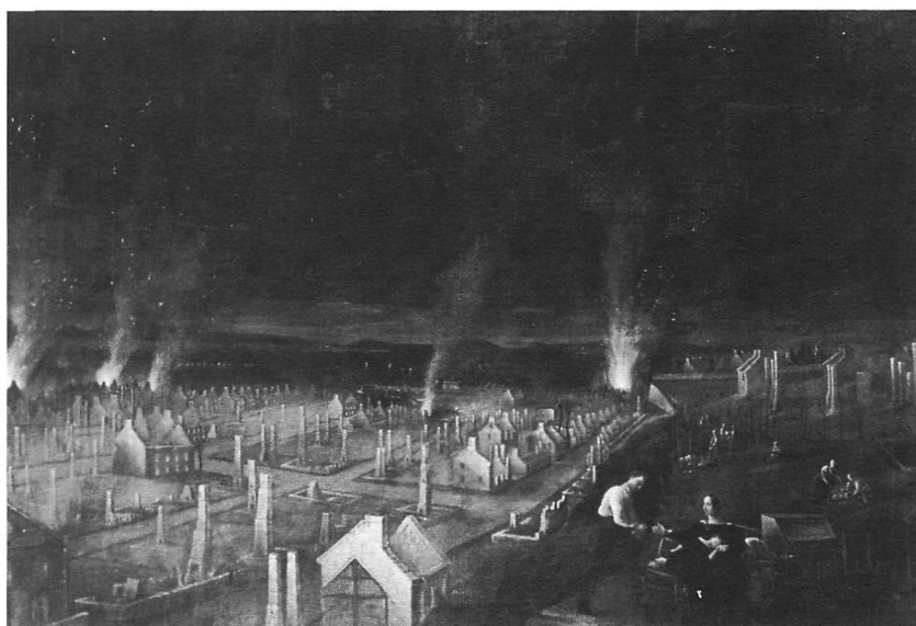
PICTURE 7: Joseph Légaré. L'incendie de quartier Saint-Roch vue de Côte-à-Coton vers l'est . (Musée du Séminaire de Québec, Québec. No. PC 984.6 R 239.).

in the picture a small group of British soldiers stands idly by, doing nothing to help with rescue work. Soldiers occur, too, in one of Légaré's views of the Saint-Jean fire: an armed formation apparently present to maintain public order.