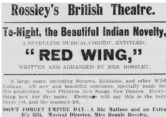
Fig. 3. Red Wing advertisement from the Evening Telegram , 22 May 1917.

The Rossleys, with their use of blackface and other racist performance practices, demonstrate the complex way that Atlantic culture has influenced racial knowledge in Newfoundland. 15 Examining this past helps us understand twentieth century constructions of blackness in Newfoundland’s settler population while highlighting the transnational connections that inform the practice of blackface minstrelsy and constructions of race in St. John’s.