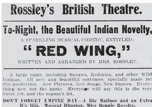
Fig. 3. Red Wing advertisement from the Evening Telegram , 22 May 1917.

The Rossleys, with their use of blackface and other racist performance practices, demonstrate the complex way that Atlantic culture has influenced racial knowledge in Newfoundland. 15 Examining this past helps us understand twentieth century constructions of blackness in Newfoundland's settler population while highlighting the transnational connections that inform the practice of blackface minstrelsy and constructions of race in St. John's.