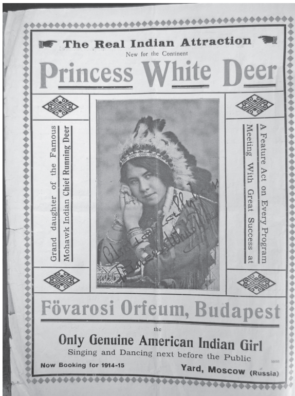
Fig. 4. Das Programm , 23 Nov. 1913, Full-page Advertisement, Sammlung Varieté, Zirkus, Kabarett, Stiftung Stadtmuseum, Berlin-Spandau.