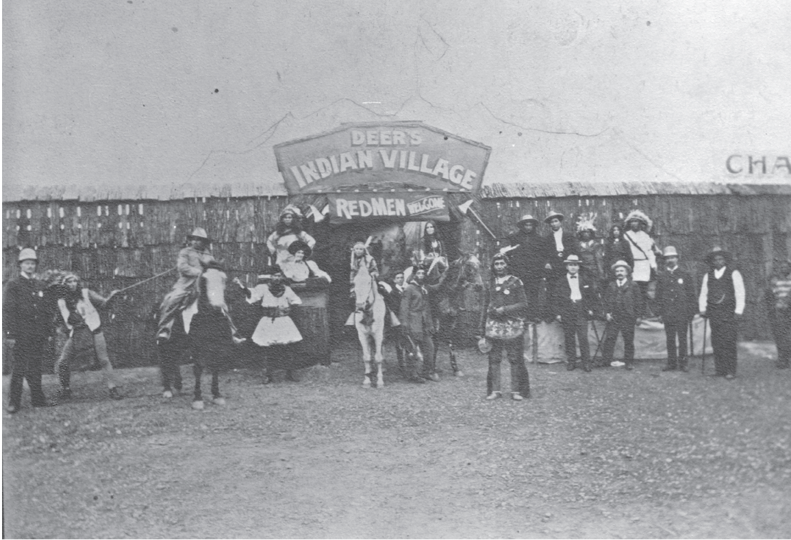
Fig. 2. Deer's Indian Village.

the specific processes, challenges, and opportunities that are bound up in her work as an author of material texts that live in the commercial sites of spectacle wherein contemporary Native experience is performed. [...] Together, we ruminated upon the Aboriginal theatre worker's struggle to address and resist being packaged as a spectacle for voyeuristic consumption while concurrently trying to attract audiences in to hear our stories. (6)