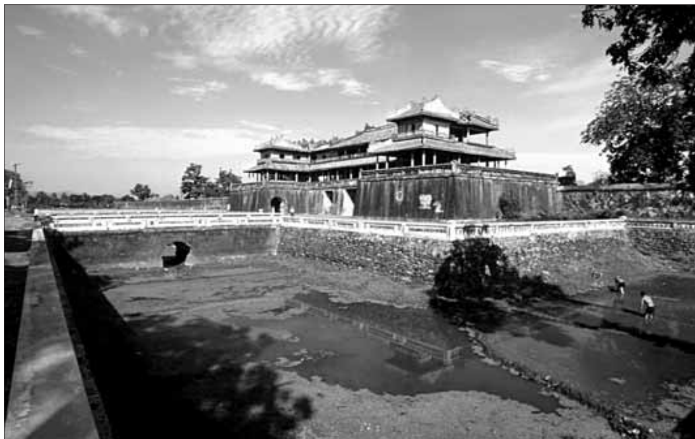
Imperial City, Southern Gate, main entrance to the palace, Vietnamese architecture, Vietnam.

Privately-owned companies (PCs) are often small-sized, family-run types of businesses; however, PCs with multiple owners can be very large. The term joint-ventures (JCs) describes a joint-invested company between a domestic company and international corporation. These companies are often large and have strong financial resources provided by foreign partners. The term equitized is perhaps customized to indicate a special type of ownership in Vietnam. State-owned companies that were in danger of bankruptcy were allowed to be equitized, meaning that they could sell up to 49% of their shares to private investors. By equitizing, the state maintains control of the company while increasing its funding from other sources. Equitized companies (ECs) are often medium or large size. Because of the difference in ownership and thus in management style, Vietnamese tourism companies may have a very different attitude towards voluntary participation in sustainable tourism programs.