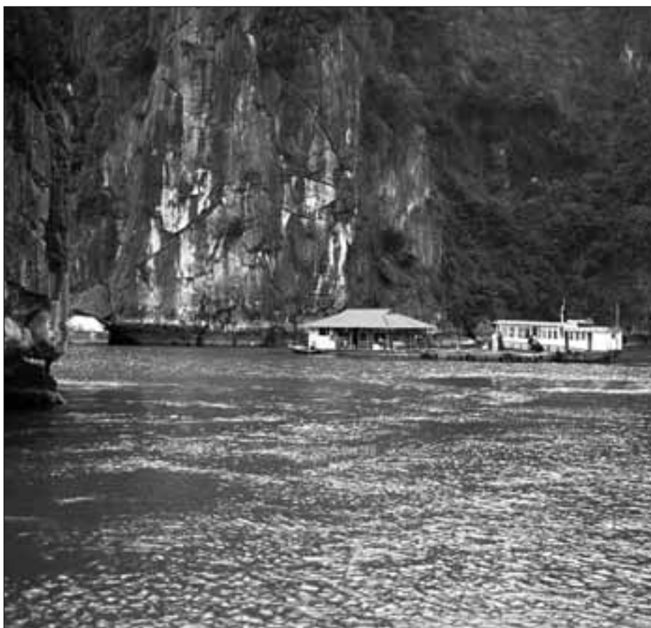
Ha Long Bay, Vietnam.

national tourism market, Vietnam had an opportunity to learn from the experience of others, including the negative impact of tourism on the natural and cultural environment that had occurred in Thailand, Indonesia, Malaysia, etc. (Marris et al. , 2003). The Vietnam National Administration of Tourism (VNAT) is actively seeking for a well-thought out tourism development plan that both promotes tourism business and protects the environment.