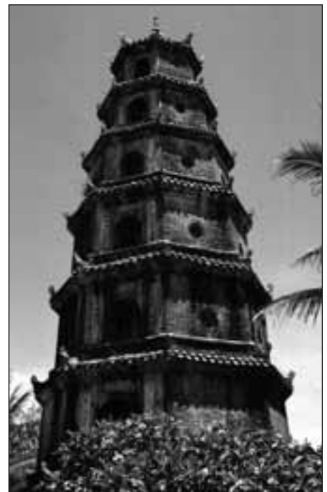
Monument on the banks of the perfume River, Hué aera, Vietnam.

A common way to assess nonresponse bias is to compare socio-economic characteristics of respondents with nonrespondents (Dey, 1997; Sheaffer et al. , 1996; Stoop, 2004). Because our unit of analysis is an organization, we used two proxies (the firm location and type of ownership) to assess nonresponse bias for both hotels and tour companies. The firms were located in three administrative regions: north, south, and central. Their types of ownership were SCs, JCs, PCs and ECs. Chi-square test results show insignificant differences in terms of location between respondents and nonrespondents ( p > 0.1 ) of both hotels and tour companies. However, with p < 0.01 , the Chi-square test results indicate a significant difference between respondents and nonrespondents in terms of ownership among tour companies, while it is not statistically significant among hotels. Among tour companies, JCs are the most responsive, while PCs are the least responsive to the survey.