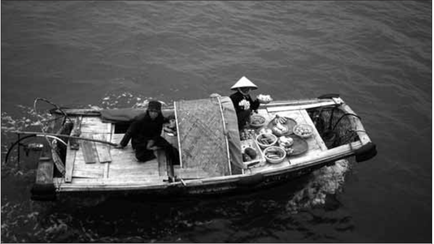
Small trade on Ha Long Bay, Vietnam.