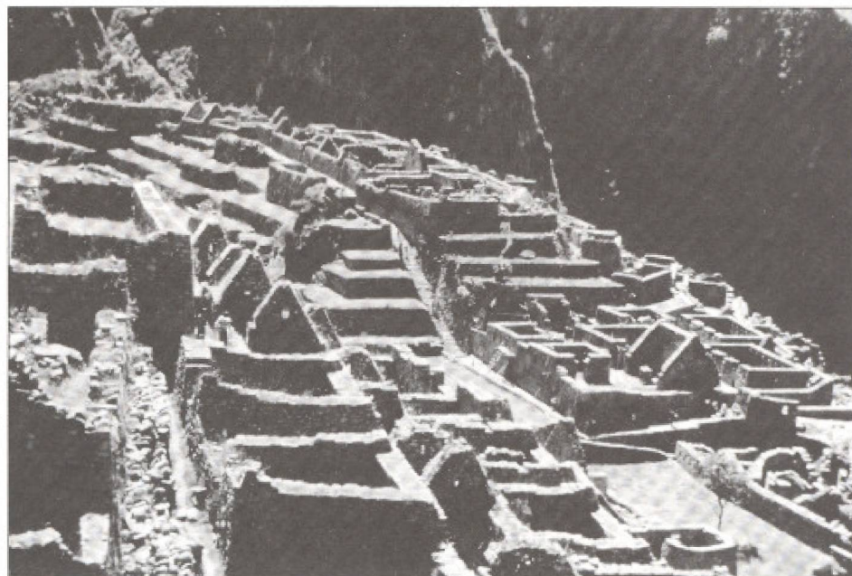
Pérou, Club Aventure.

I recently went with my 8 and 12 year-old children to see Walt Disney's animated cartoon feature called The Lion King . Upon returning home, they scrambled to the family library and opened up a picture book on the animals of the world. They immediately indexed out the l for lion , and then the j for jaguar , the latter being the largest cat that they knew existed in Ecuador's Amazon rainforest. They then approached me with a rather inquisitive look, and the interrogations followed. «Daddy, how many times have you seen a jaguar on your tours to the Amazon?» I replied, «Well, to be precise, in 25 years it's been once plus some footprints another time; but it's more a matter of sharing their environment for a while than actually seeing them - that's partly what ecotourism is about». I felt my explanation went unnoticed when, with squinting eyes, they retorted, «Bet the oil people got the rest». Silence followed, after which they assured me, «Don't worry, Daddy, we'll try to do something».