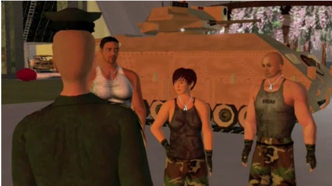
Still image of avatars from the machinima Gud och Hela Nation ('God and Country')