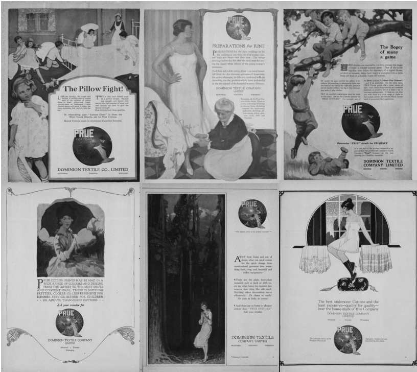
Figure 5: Ads for Prue Cottons from January, February, March, June, September, and October 1920; all are inside-front-cover ads.

of their banality, reflect the surface-level topics produced by MALLET, with their focus on things and people, houses and cars.