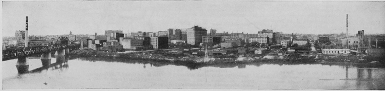
Figure 2: Ad for the Stovel Company, September 1929.

Winnipeg—TODAY. Photo taken from the same point as the first reproduction