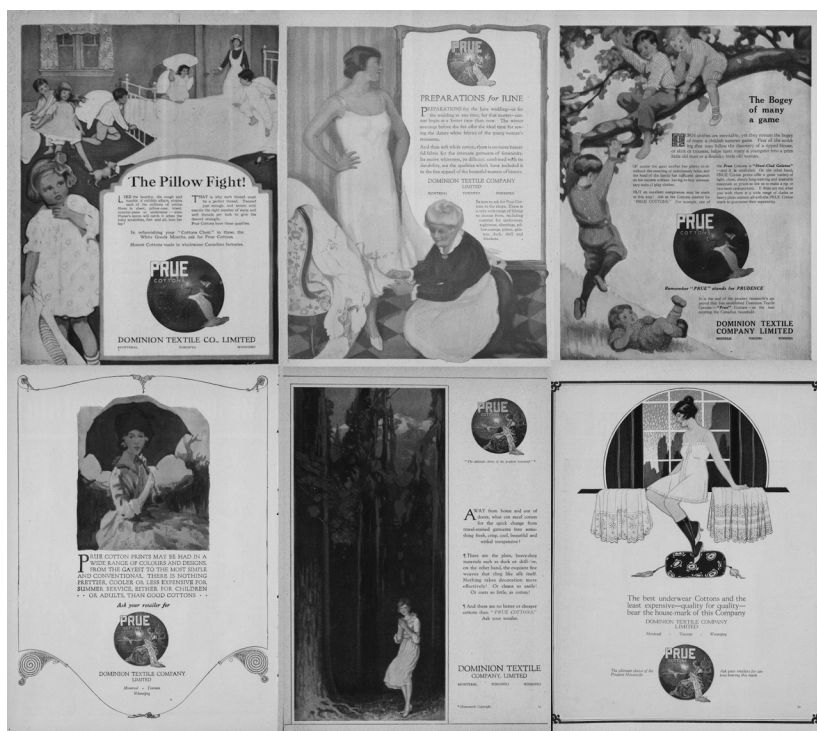
Figure 5: Ads for Prue Cottons from January, February, March, June, September, and October 1920; all are inside-front-cover ads.

of their banality, reflect the surface-level topics produced by MALLET, with their focus on things and people, houses and cars.