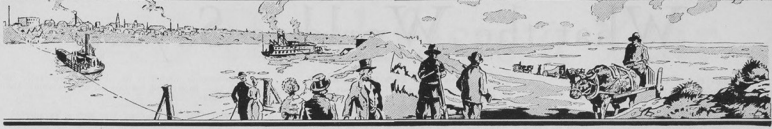
Early Winnipeg as viewed from St. Boniface across the Red River in 1859