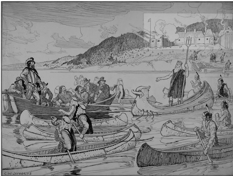
Fig. 1. C.W. Jefferys, drawing, The First Play in Canada (1942). The Picture Gallery of Canadian History 83.

surrounds the material contexts of the play because Le Théâtre de Neptune survives only as a play script in Lescarbot's own historical writings, prompting some critics to speculate whether the masque was ever actually performed. 5 According to Lescarbot, however, the performance of the play was instrumental in establishing Champlain's L'Ordre de Bon Temps (the Order of Good Cheer), which codified eating and entertainment, in 1606. 6 Lescarbot's self-congratulatory report indicates that the performance and the Order of Good Cheer were successful in preventing another winter of death, scurvy, and hunger. Charles William Jefferys's twentieth-century pen-and-ink drawing of "The First Play in Canada" (see figure 1) offers an imagined reconstruction of the event with French and Mi'kmaq performers in canoes, a reconstruction which continues to shape readers' conception of the performance from the cover of Jerry Wasserman's recent edition, The Spectacle of Empire: Marc Lescarbot's Theatre of Neptune in New France (2006).