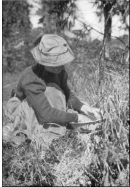
Fig. 4. "Washing-Day."

The photograph of Hubbard with the Innu pictures her standing on a rock, her hand raised and her index and middle fingers pointed, apparently lecturing to