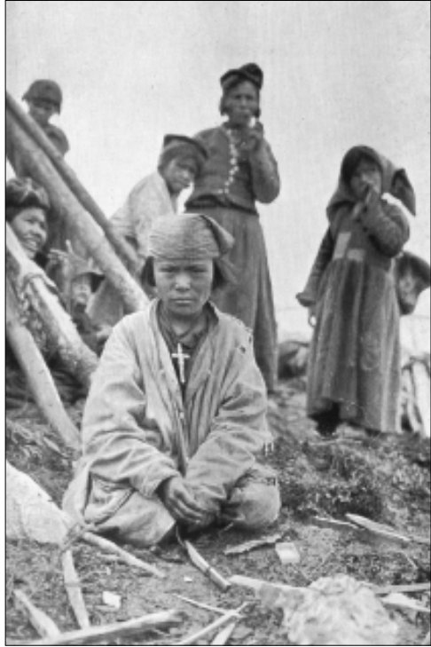
Fig. 2. “A Montagnais Type.”

see also Kaplan 9-10). Hubbard writes, in fact, that “the types were various as those to be found in other communities ranging from the sweet and even beautiful face to the grossly animal like” (191). She describes the Innu men as having “markedly Indian faces,” and writes about them alternately as noble savages — “tall, lithe, and active looking, with a certain air of self-possession and dignity which almost all Indians seem to have” (203) — and as a collective and stereotyped “mind” that is focused mostly on gifts of tobacco from Hubbard’s party — “I could not know how far the Indian mind had been influenced, in gauging