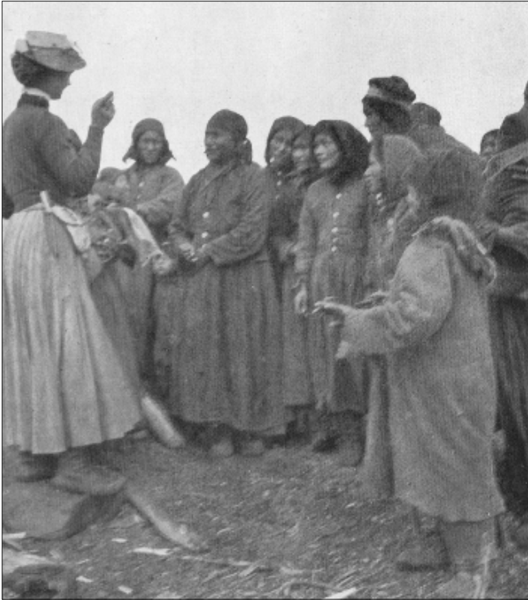
Fig. 6. "With the Nascaupee Women."