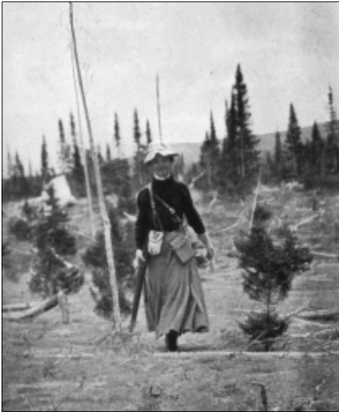
Fig. 5. "On the Trail."

(or at least talking to) the women (fig. 6). She is represented not only as the first white woman to speak to the Innu of this area but, in this photograph, as dominant in terms of her physical position. She stands above them; her raised hand and pointed fingers indicate that she is saying something of import. Contact and communication with First Nations is an essential part of the explorer's work and, the photo implies, such contact and communication was successful. Her narrative, in