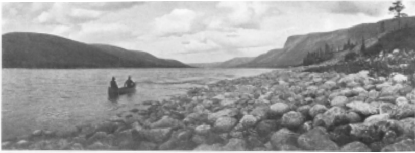
Fig. 8. "Bridgman Mountains."

Often passages in her book are more metaphoric than those in her diary in order to be less directly personal, and thus make more use of the landscape as a means of expression. She writes, for example,