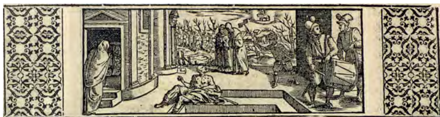
Figure 11. March, Missale Romanum, ex decreto sacrosancti Concilij Tridentini restitutum (Venice: Lucantonio II Giunta, 1576), f o , woodcut. ©Biblioteca Nazionale Centrale di Roma, 12. 9.H.1, sig. +5r (detail).

The 1576 Missal exhibits the same dialogic relationship between the imagery of February and March as that encountered in Leandro's cycle. The woodcut of February, first considered in this article, depicts an early and unique visual document of the comic group of the master Pantalone and his servant Zanni performing at a courtly banquet (fig. 10). 84 The characteristic mask and pose of the greedy Pantalone, who leans forward with one hand behind and one in front, recalls the gesture of the analogous figure in Leandro's canvas. His servant Zanni wears the typical clothes of the Bergamasque peasant porter, with loose, ankle-length trousers and a long-sleeved jacket of light-coloured linen. 85