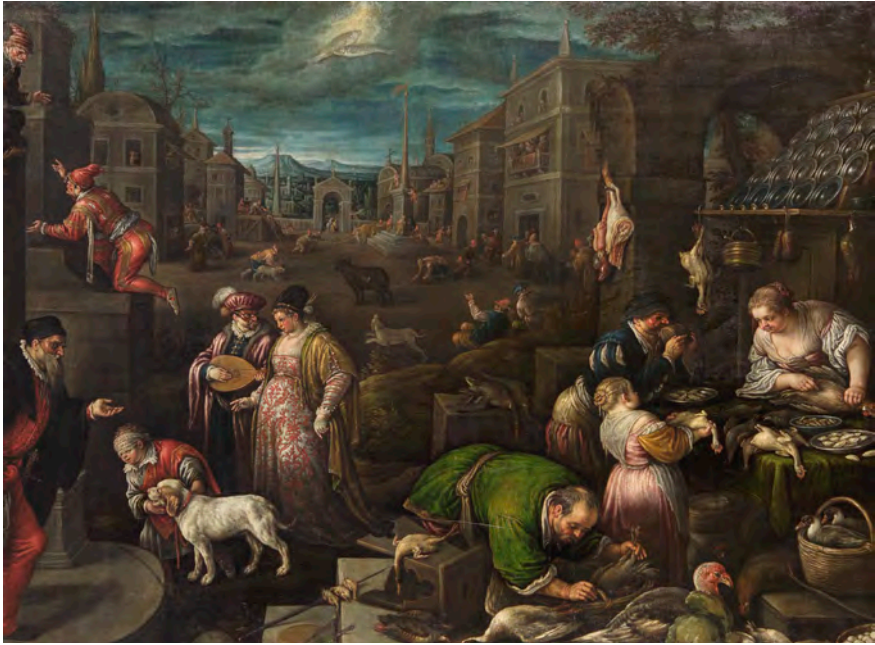
Figure 1. February , Leandro Bassano, The Twelve Months , before 1595, oil on canvas, canvas size 144.5 × 190 cm. © KHM-Museumsverband, Inv. Gemäldegalerie, 4293.

in Vienna and the Prague Castel Picture Gallery. 6 Based on the accounts of Carlo Ridolfi, scholars have identified Leandro's Months with the cycle sent by Jacopo Bassano to Emperor Rudolf II (1552–1612). 7 The two preserved series are in accordance with the encyclopedic style of the Bassano brothers, manifested through the borrowing of elements from different sources, from prints to previous repertoires of the workshop, and elements from Flemish artists, displayed in densely populated landscapes.