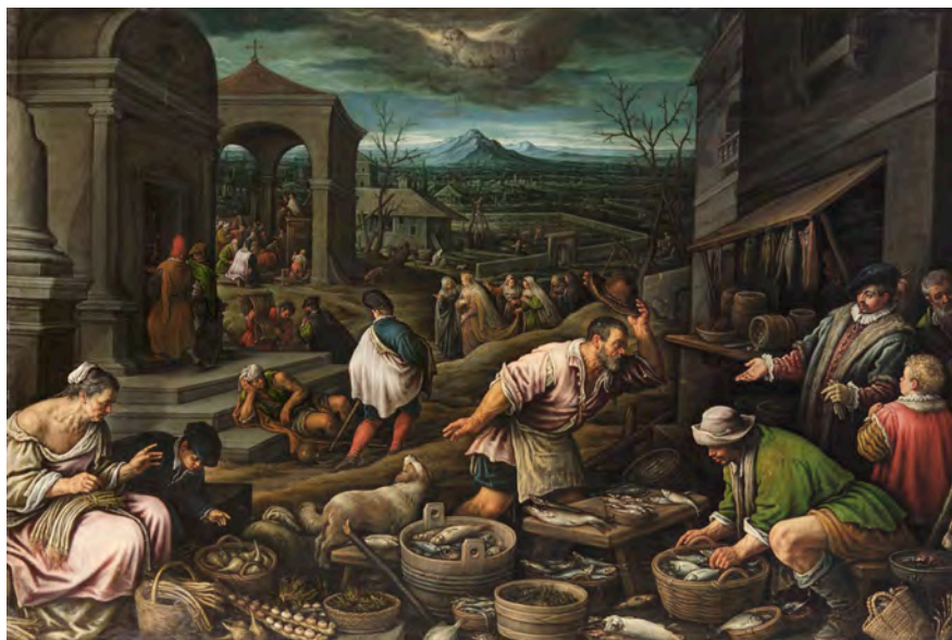
Figure 2. March , Leandro Bassano, The Twelve Months , before 1595, oil on canvas, canvas size 145.5 × 216 cm. © KHM-Museumsverband, Inv Gemäldegalerie, 4296.

This study focuses on Leandro's paintings of February and March (Kunsthistorisches Museum, Gemäldegalerie, Inv. 4293 and 4296) since the respective canvases from Francesco's set were destroyed in 1915. 8 It also introduces an intact set of small-size replicas produced most probably in Leandro's workshop, originating from the estate of the Count of Bobrinsky, in Bogoroditsk, now in the Regional Museum of Fine Arts in Tula. 9