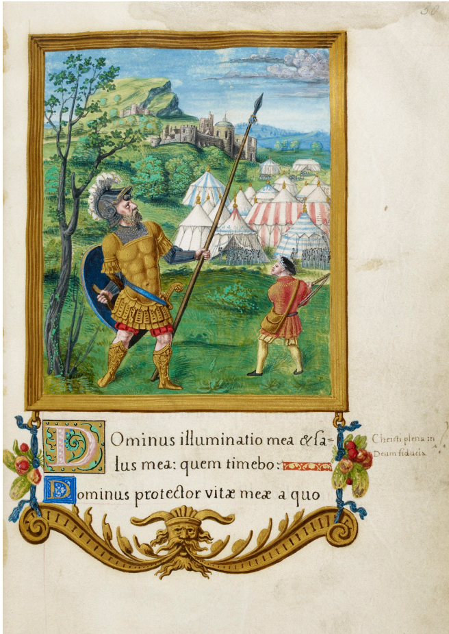
Figure 1. Henry VIII as David fighting Goliath, Psalm 26 in Henry VIII's Psalter.