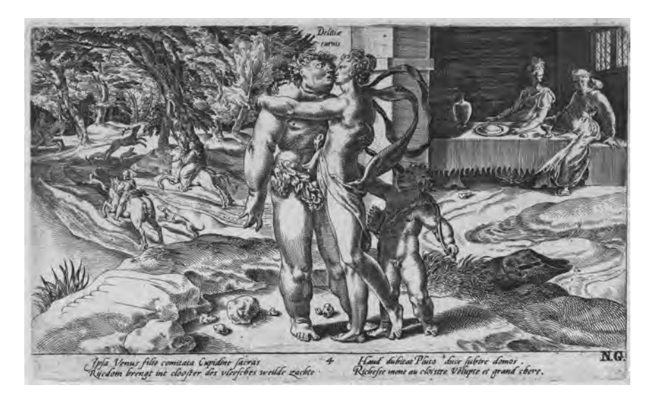
Figure 4. Wealth Bringing Sex and Alcohol into the Cloisters.