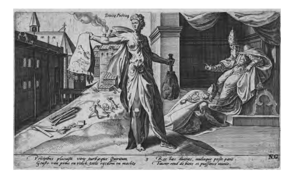
Figure 3. Wealth and Power Making their Entry into Society.