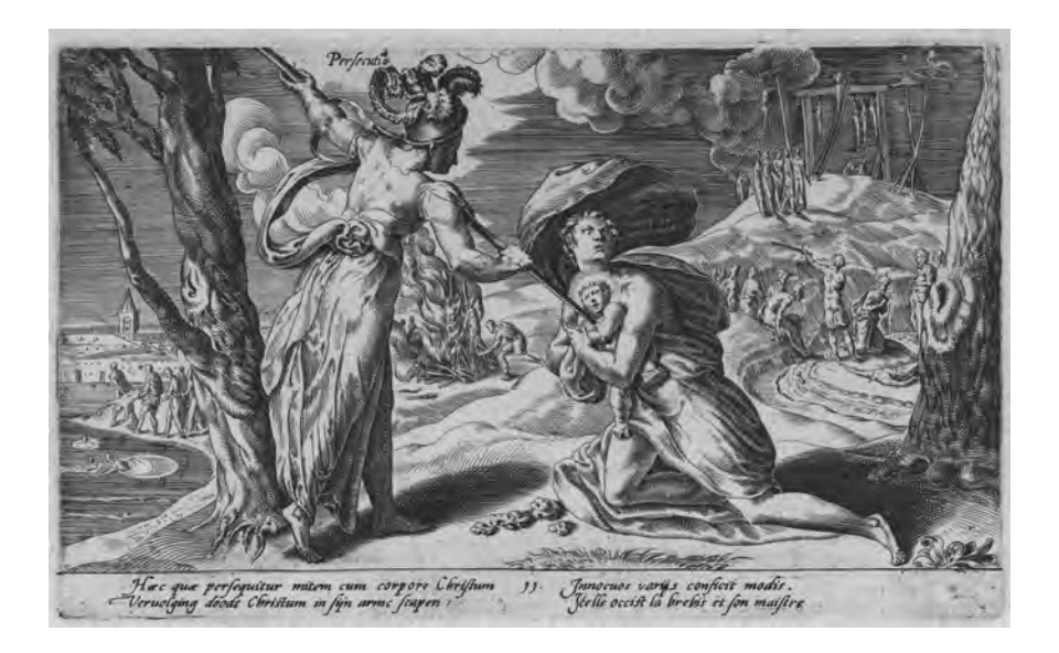
Figure 11. Innocent Christians Persecuted.