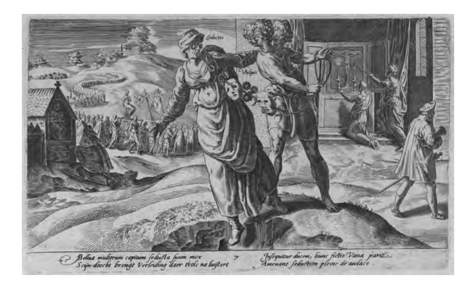
Figure 7. Deceit Bringing the People to Ruin. Collection Rijksmuseum, Amsterdam