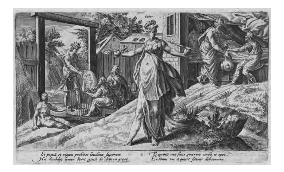
Figure 2. Man Rewarded for his Piety. Collection Rijksmuseum, Amsterdam