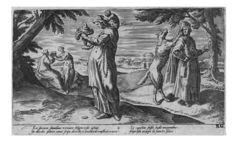
Figure 6. Hypocrisy Replacing Piety. Collection Rijksmuseum, Amsterdam