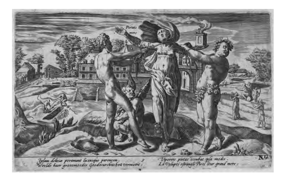
Figure 5. Sex and Alcohol Strangling Piety. Collection Rijksmuseum, Amsterdam