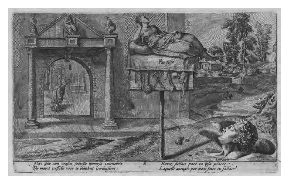
Figure 8. Ignorance Concealing the Falsehood of Peace . Collection Rijksmuseum, Amsterdam