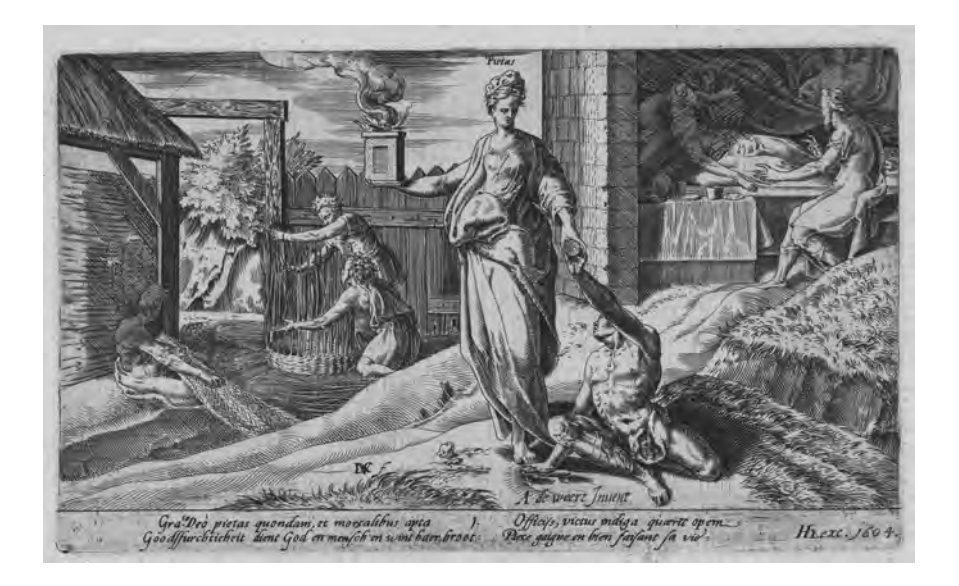
Figure 1. Man Piously Doing his Duty. Collection Rijksmuseum, Amsterdam