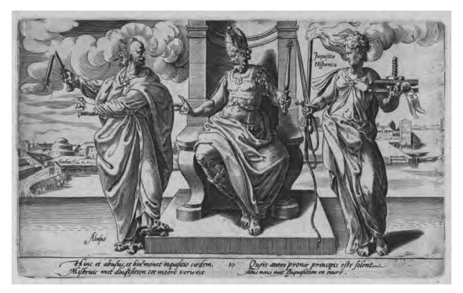
Figure 10. Corrupt Rulers and the Spanish Inquisition Committing Murder.