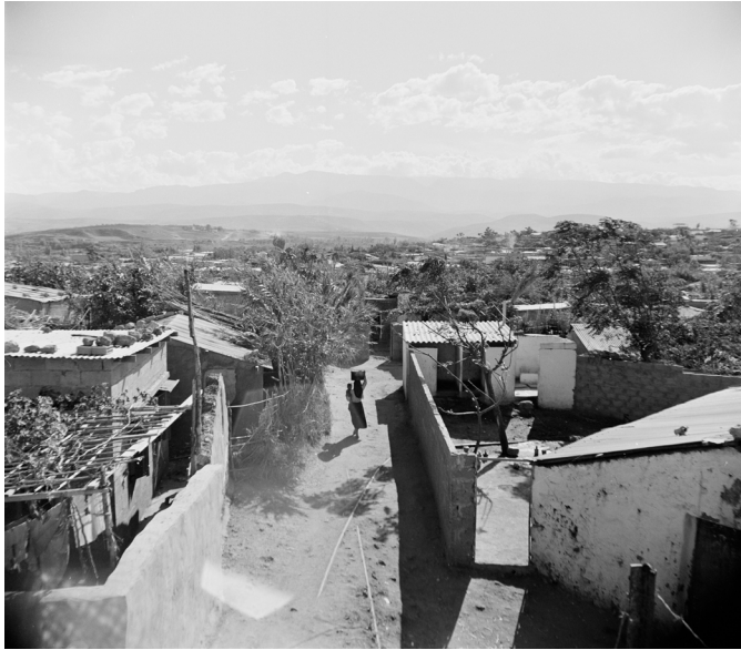
Figure 2. Nahr al-Bared, ca. 1960

© UNRWA. Reproduced with permission by the United Nations Relief and Works Agency for Palestine Refugees in the Near East (UNRWA) under licence agreement signed 31 October 2018 between the author and UNRWA.