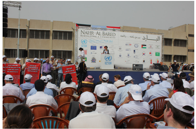
Figure 5. Nahr al-Bared inaugural ceremony (Package 1), 2011

Despite completion of the first reconstruction package, the residents were fed up with the living conditions in the camp and suffered from stress, frustration, and anger. In mid-June 2012 a new round of protests broke out in the camp. At one army checkpoint, a quarrel over entry permits led to army guards killing a fifteen-year-old boy. 87 With the camp's cemetery already filled beyond capacity, burial was impossible within the confines of the camp. The next day the victim's body was taken for burial on a piece of land owned by the PLO but controlled by the army. When the army intervened to stop the burial, fighting broke out and the soldiers on duty, claiming to be under attack, fired into the crowd, killing two and injuring twenty. 88 These incidents sparked countrywide protests and provoked clashes, strikes, and sit-ins in support of the victims. The situation in the Nahr al-Bared camp long remained tense, with the army claiming that it had been "infiltrated" by pro-Syrian elements