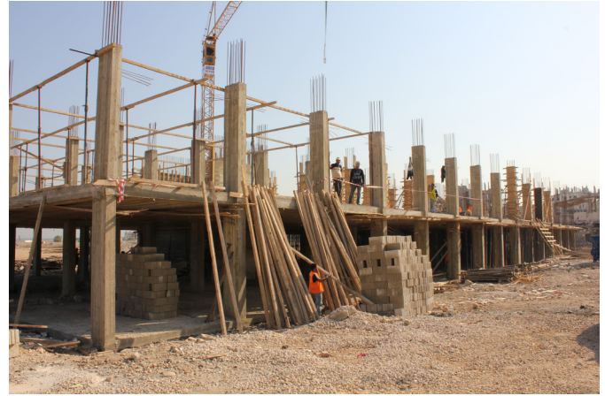
Figure 4. Floating slab foundation used in reconstructing Nahr al-Bared, 2011

This building technique avoids digging deep into the ground, which could potentially harm archaeological remains but, more importantly, prevents access to the many underground bunkers that were excavated during the civil war. The bunkers were one reason why the army took so long to dislodge Fatah al-Islam. The floating slab foundation was chosen to securitize the camp’s reconstruction and prevent the camp from becoming an insurgent base. Hence the army sought to transform the camp from a potential “zone of outlaws” to a military “zone of security” where the residents had minimal influence on their urban space. In this sense, the army emerged as an urban planner, stewarding