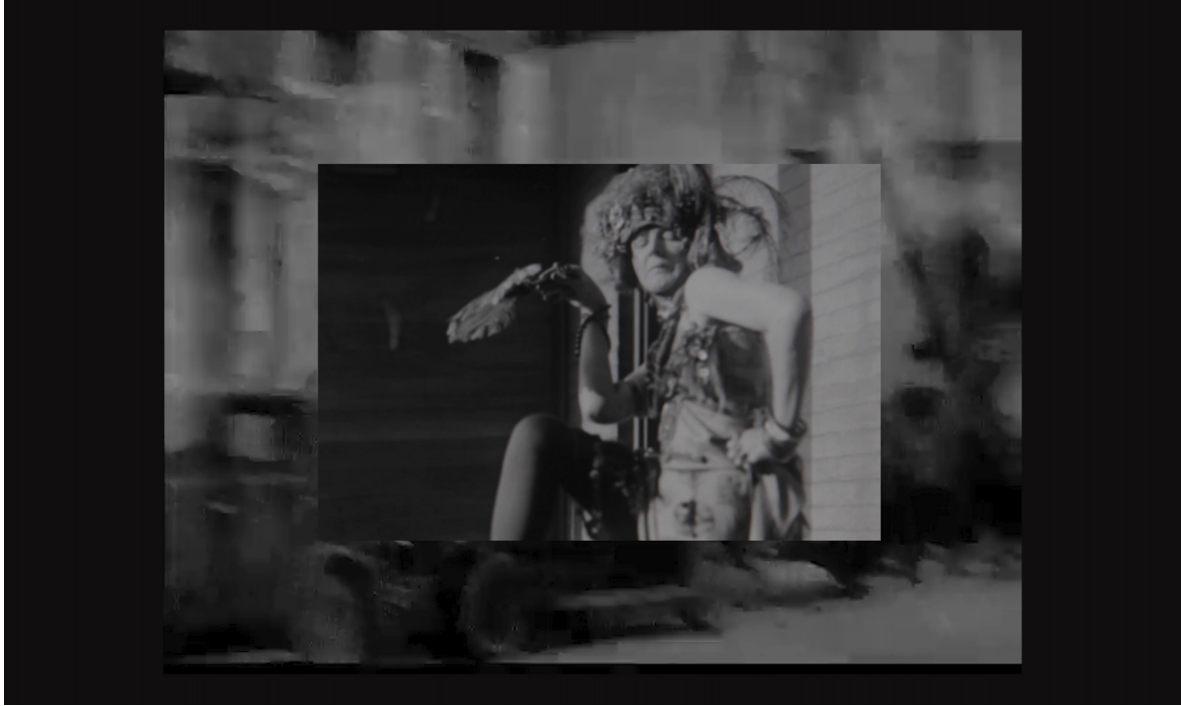
Figure 6. Carol Sawyer, Subjoyride , 2021. Black and white video with sound, 7:00. Music and sound design by Aleksandar Zecevic and editing assistance by Amo Yue Wang. Video still. Courtesy of the artist.