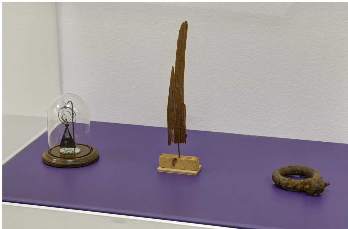
Figure 2. Elsa von Freytag-Loringhoven, Earring Object , c. 1918. Steel watch spring, celluloid, ebony bead, brass ear screws, plastic screw guards, pearl earrings, Roboid wire, 7.62 x 3.81 cm. Wooden and glass display 10.8 high x 10.8 cm wide; Cathedral , ca. 1918. Wood fragment, wire support with wooden blocks on wood base, 26.5 cm high; Enduring Ornament , 1913. Found rusted metal ring, 10.8 cm. Collection of Mark Kelman.