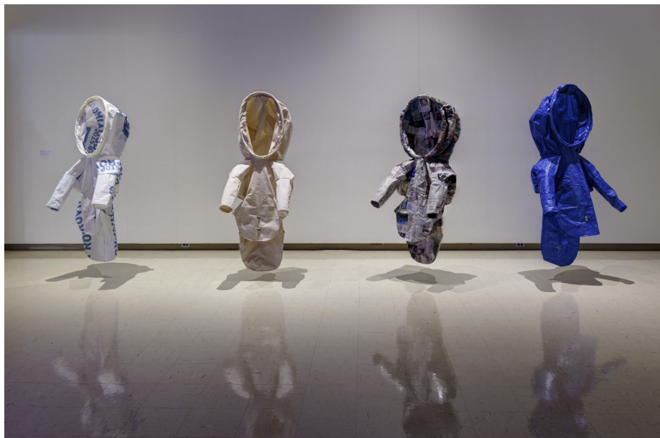
Figure 14. Taqralik Partridge, Build My Own Home , 2021. Tyvek, canvas, newsprint, tarpaulin, hula hoops, thread, dental floss, synthetic sinew, silver teaspoons. Collection of the artist.