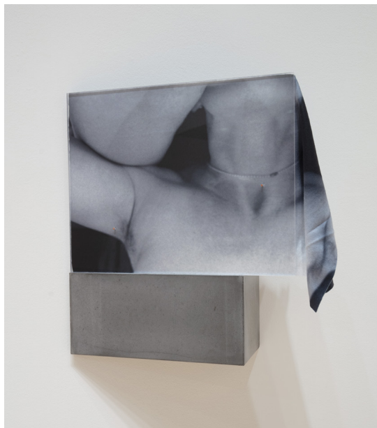
Figure 12. Sheilah ReStack, Be a Highway Be a Thigh (for Dani) , 2020. Fleece photo blanket, Plexiglas, copper, cement wedge. Collection of Joanne Hames.