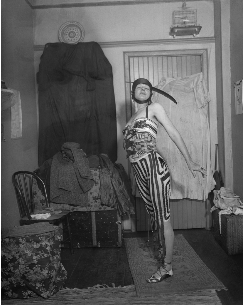
Figure 1. The Baroness Elsa von Freytag-Loringhoven in her Greenwich Village apartment, December 7, 1915.