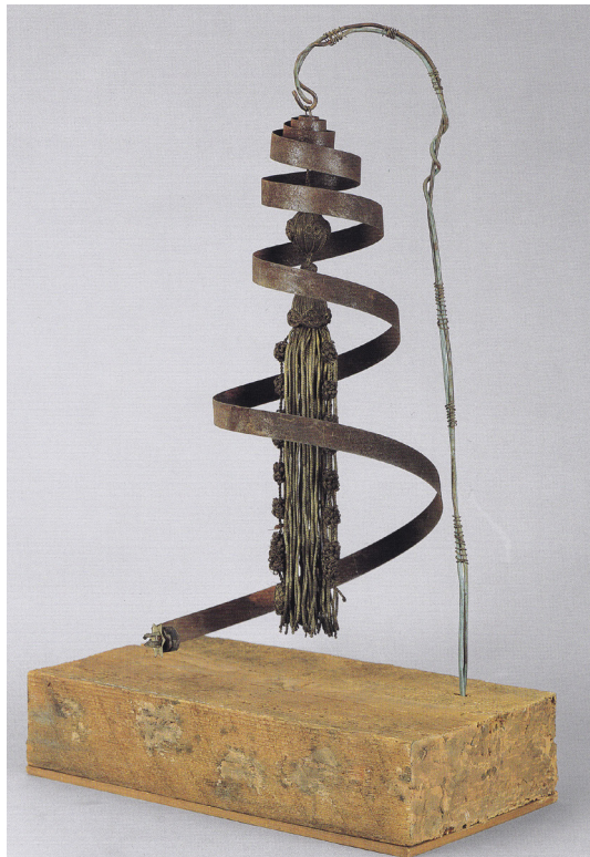
Figure 4 (far right). Elsa von Freytag-Loringhoven with Morton Schamberg, God , 1917. Wood miter box; cast-iron plumbing trap, 31.4 cm (height), 7.6 × 12.1 × 29.5 cm (base). Philadelphia Museum of Art: The Louise and Walter Arensberg Collection, 1950, 1950–134–182.