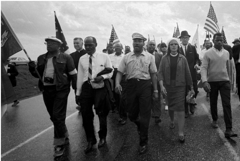
Figure 6. Ivan Massar. Rev. and Coretta King leading the March, Selma to Montgomery , 1965.