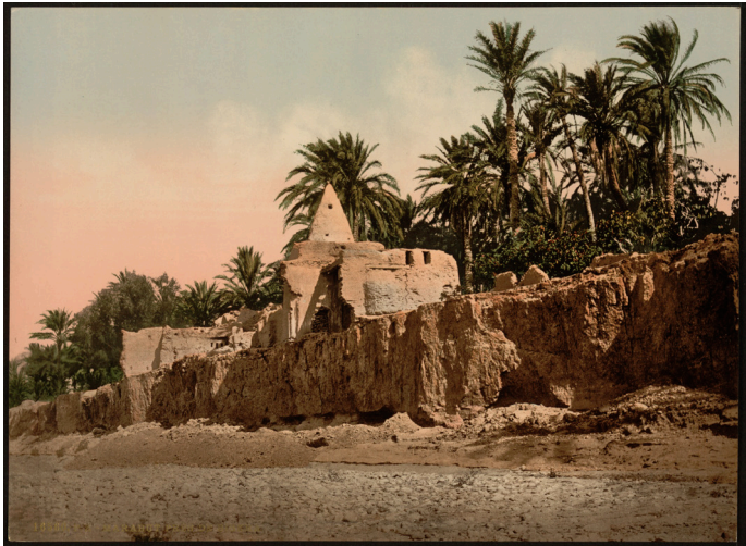
Figure 4. Marabout near Biskra, Algeria, ca. 1900. Photochromic print.