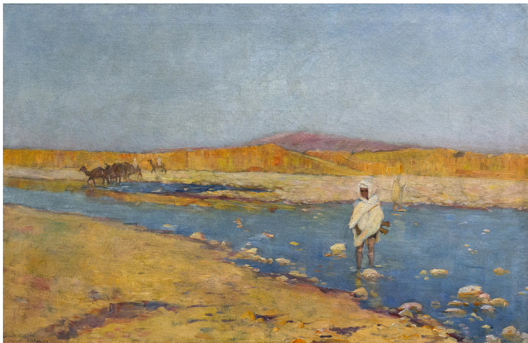
Figure 6. Maurice Cullen, Biskra , 1893. Oil on canvas, 53.6 × 81.9 cm. Montreal Museum of Fine Arts.