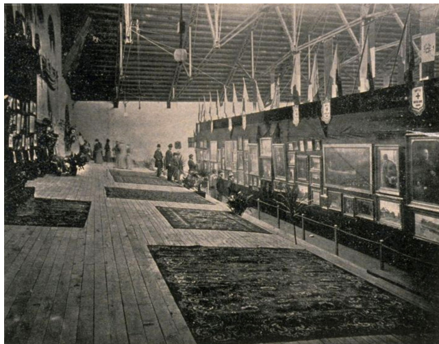
Figure 2. A.J. Rice, Laprés & Lavergne, Montréal. La grande kermesse de l'Hôpital Notre-Dame, Galerie des beaux-arts, 1895. From Le Monde illustré (Montreal) 12 année, no. 599 (October 26, 1895): 385.

culminated in the European “scramble for Africa” in the 1880s and the rise of the American and Japanese Empires in the early twentieth century. 14 Global Impressionism thus coincided with the imperialist reordering of the globe.