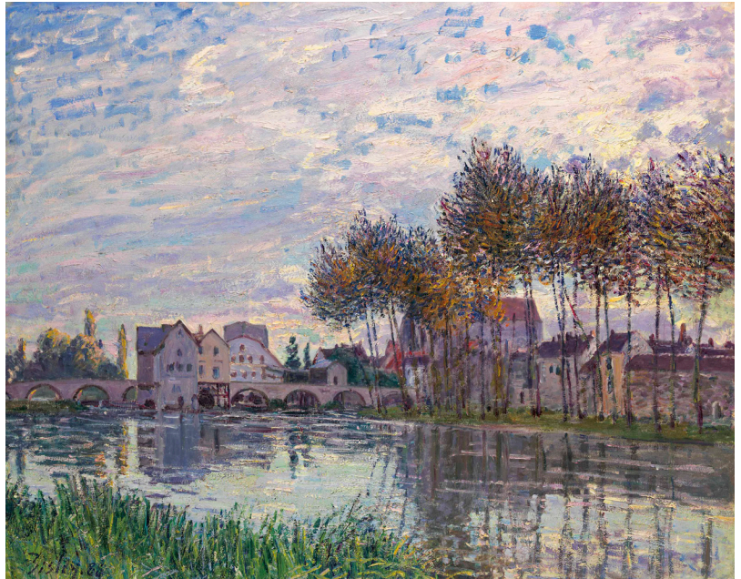
Figure 9. Alfred Sisley, Moret au coucher du soleil, octobre, 1888 . Oil on canvas, 73.5 × 93 cm. Private collection.