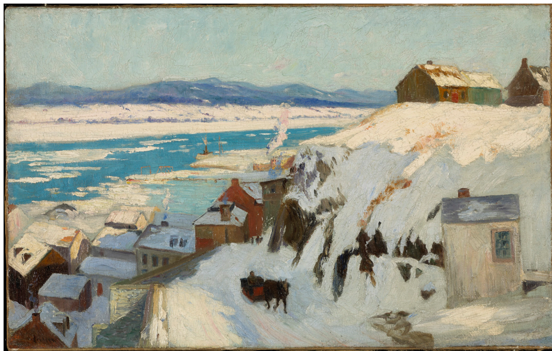
Figure 12. Maurice Cullen, Lévis, Quebec , c. 1897. Oil on canvas, 46.3 × 73.5 cm. National Gallery of Canada, Ottawa. Purchased 2014 with the Andrea and Charles Bronfman Canadian Art Fund, National Gallery of Canada Foundation.