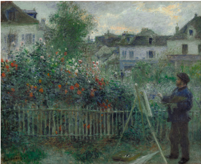
Figure 8. Pierre-Auguste Renoir, Claude Monet Painting in His Garden at Argenteuil , 1873. Oil on canvas, 49.7 × 59.7 cm. Wadsworth Athenaeum Museum of Art, Hartford, Ct.