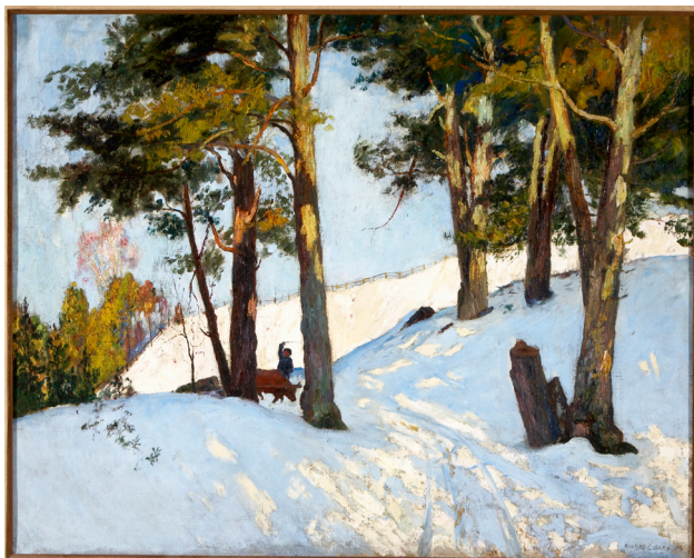
Figure 11. Maurice Cullen, Logging in Winter near Beau-pré , 1896. Oil on canvas, 64.1 × 79.9 cm. Art Gallery of Hamilton. Gift of the Women's Committee dedicated to the memory of Ruth McCuaig, President of the Women's Committee (1953–1955), 1956.