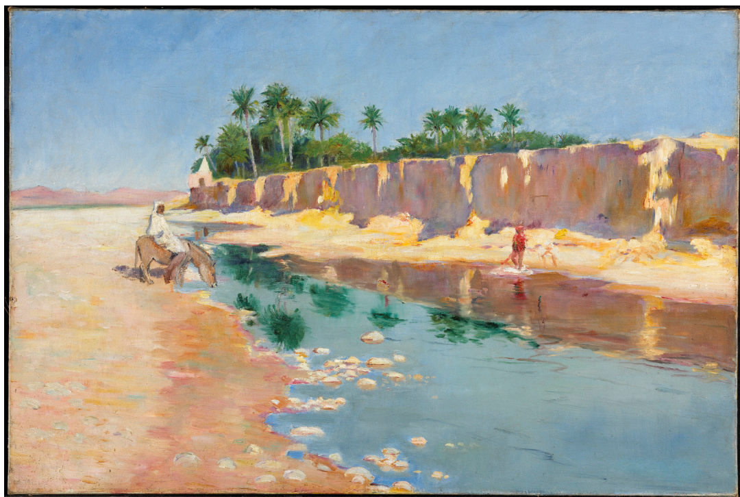
Figure 1. Maurice Cullen, An African River , 1893. Oil on canvas, 54 x 81.3 cm. National Gallery of Art, Ottawa. Purchased 1981.