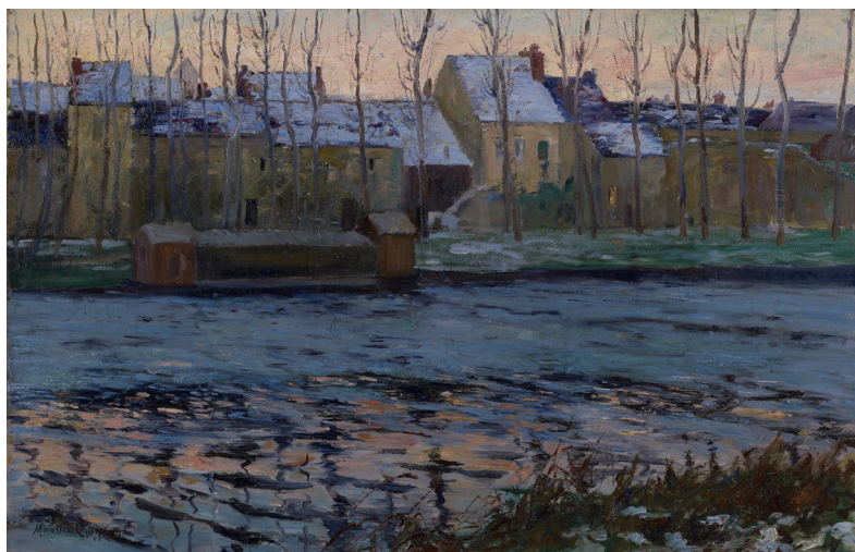
Figure 10. Maurice Cullen, Moret, Winter, 1895 . Oil on canvas, 59.7×92.1 cm. Art Gallery of Ontario, Toronto.