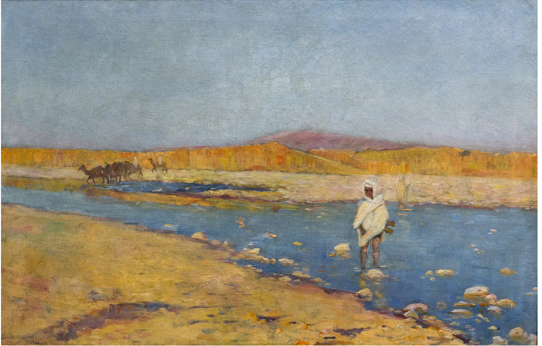
Figure 6. Maurice Cullen, Biskra , 1893. Oil on canvas, 53.6 x 81.9 cm. Montreal Museum of Fine Arts.