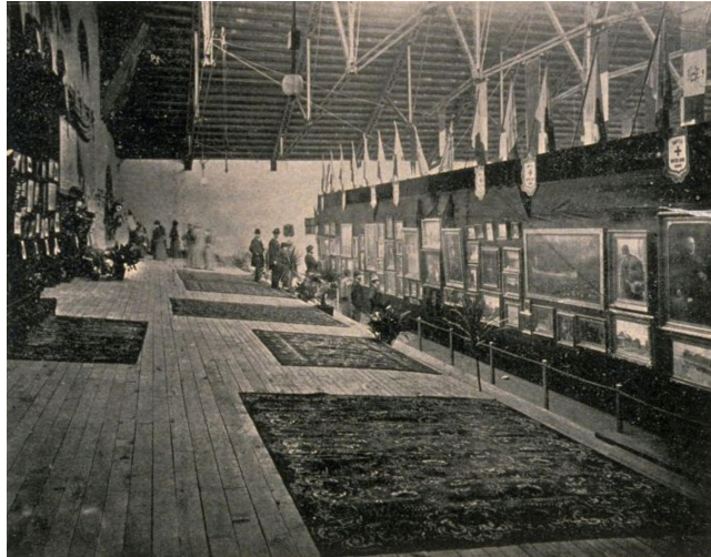
Figure 2. A.J. Rice, Laprés & Lavergne, Montréal. La grande kermesse de l'Hôpital Notre-Dame, Galerie des beaux-arts, 1895. From Le Monde illustré (Montreal) 12 année, no. 599 (October 26, 1895): 385.

Canada: From Impressionism to Modernism," in Atanassova, Canada and Impressionism , 116, 118.