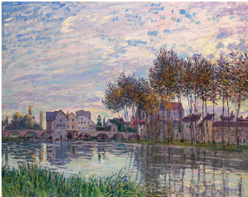
Figure 9. Alfred Sisley, Moret au coucher du soleil, octobre, 1888 . Oil on canvas, 73.5×93 cm. Private collection.