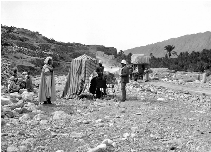
Figure 5. French painter in Kbour-el-Abbas, El Kantara, Algeria, ca. 1900.