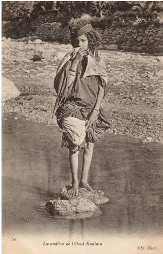
Figure 3. Étienne and Louis-Antonin Neurdein, Lavandière de l'Oued-Kantara , ca. 1900.