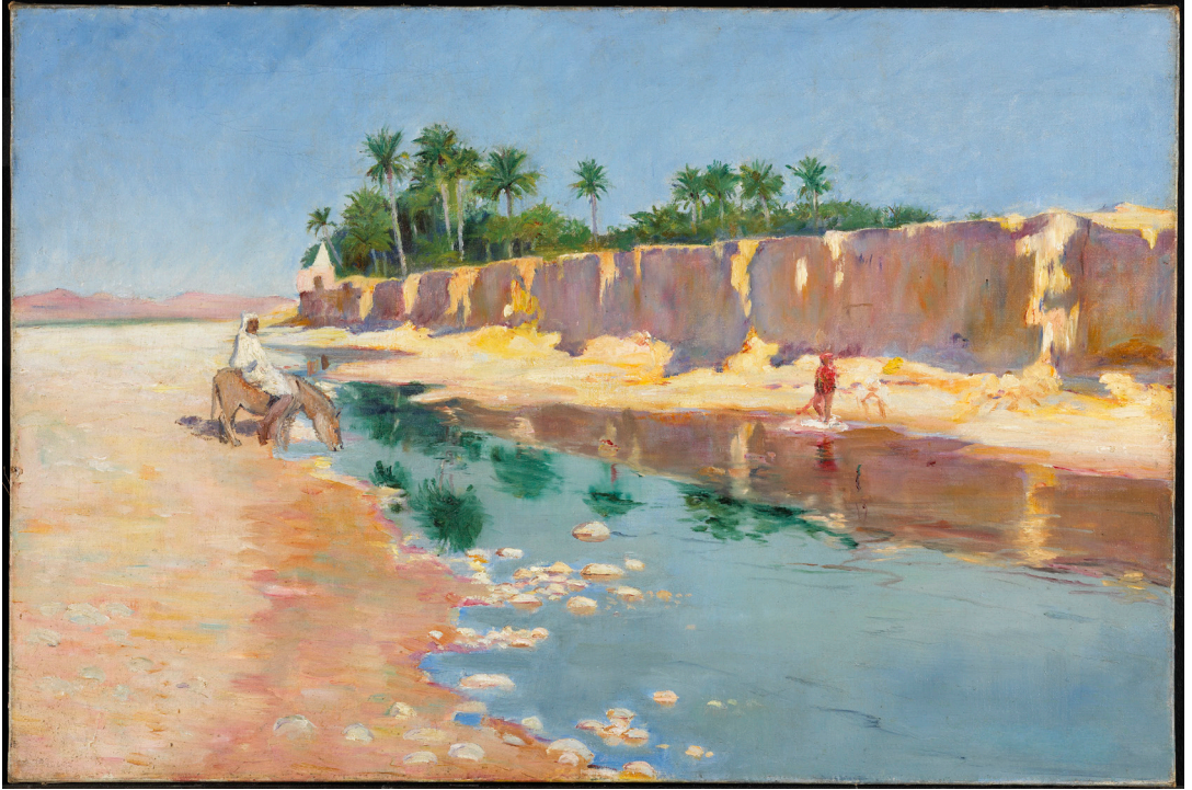
Figure 1. Maurice Cullen, An African River , 1893. Oil on canvas, 54 × 81.3 cm. National Gallery of Art, Ottawa. Purchased 1981.