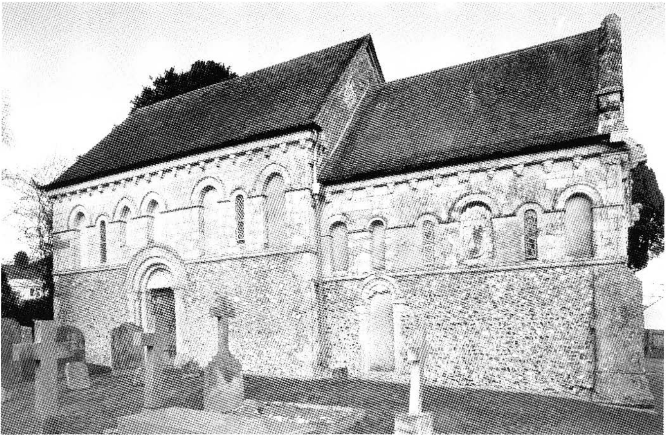
Figure 1. St. Nicholas, Barfreston, Kent, from the southeast (ca. 1185) (Photo: Malcolm Thurlby).

The scope of the corbel imagery encountered at these three Romanesque churches is wide. This paper focuses on a selection of human and animal figures and heads, leaving the carvings of foliage and geometric shapes for future discussion. Carved corbels are specialized architectural details, and deserve more attention and study. The architect and author Joseph Gwilt offers a precise visual description of corbels in his encyclopedia of 1842, published at the beginning of the period of the empirical study of medieval architecture. 2 He lists corbels as “a range of stones projecting from a wall for the purpose of supporting a parapet or the superior projecting part of wall. Their fronts are variously moulded or carved.” 3 Clearly, Gwilt was thinking of large-scale buildings because he neglected to mention that corbels also appear beneath the eaves of the roofs of small churches and chapels. Gwilt’s description, reflecting the nineteenth-century focus on monumentality, is nonetheless valuable for illustrating the marginal position of corbels because of their location at the extreme limits of the architectural fabric of churches. It is not surprising, then, to see corbel carving neglected in the literature on medieval architecture. However, the enormous number of