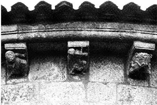
Figure 8. Corbel table at Martha-Marestay, Charente-Maritime (viol player dancing between cowering human and a monster devouring two humans).