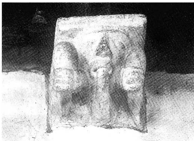
Figure 10. Megaphallus corbel at Holy Cross, Avening, Gloucestershire.