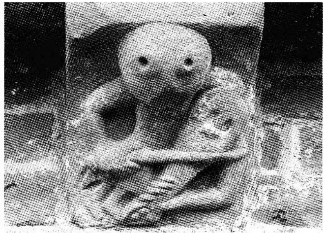
Figure 9. Corbel no. 43 (viol player), St. Mary and St. David, Kilpeck, Oxfordshire (Photo: Malcolm Thurlby).

the church building and into the mundane but sinful world. The question that is difficult to answer with certainty is whether people laughed or trembled at the depictions of sinful behaviour. It is possible that ordinary folk were both afraid and entertained by the predicament they found themselves in, full of sin but without the resources to purchase indulgences to alleviate it.