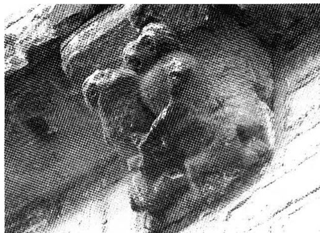
Figure 11. Simian imagery on a corbel at All Saints, Lullington, Somerset.

sual and textual components describing the natural and moral characteristics of real and imaginary animals. For example, the bestiaries associated the female bird-human hybrid, called a siren, with immoral temptation. The connection between carved sculpture on medieval churches and the bestiaries has been difficult to determine except in a few well-known cases. The church of St. Mary, Alne, has figurative motifs carved in the voussoir stones with identifying inscriptions related to the Oxford Bodleian MS Laud bestiary. 31 The interpretation of most carved sculpture, however, remains speculative and open to new interpretation. The use of bestiaries in the education of illiterate acolytes of the medieval Church 32 suggests the possibility that carved images of bestiary figures were instructive in purpose. I subscribe to the notion forwarded by Ron Baxter, who argues that the bestiaries were systematically organized around ideological themes. 33 If this is correct, there is no reason not to believe that carved corbels making references to hybrids found in bestiaries were also organized systematically.