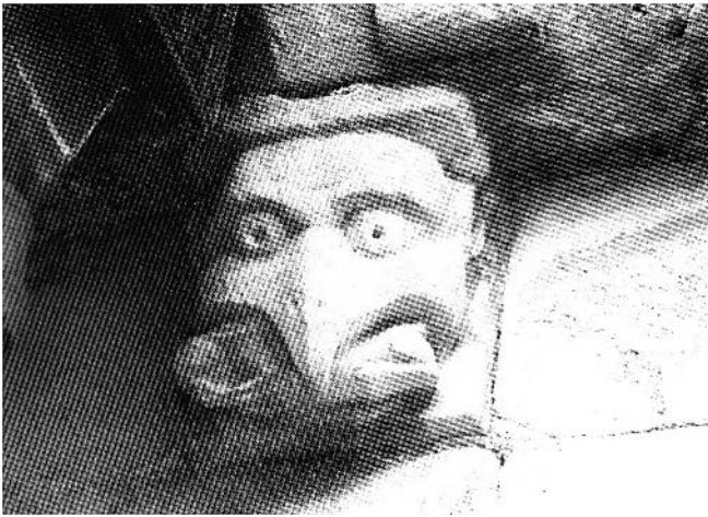
Figure 6. Corbel no. 1 of the south chancel (beakhead devouring rabbit). St. Nicholas, Barfreston, Kent.