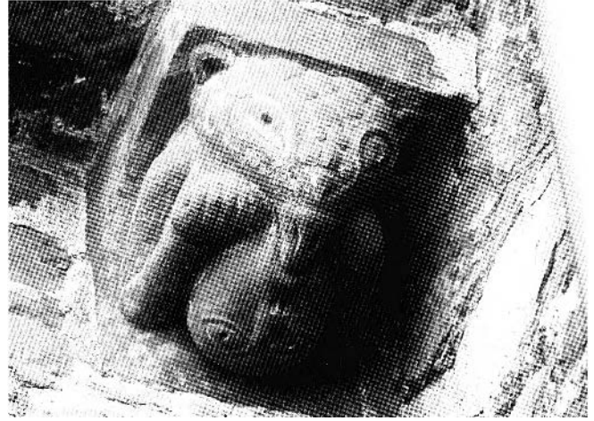
Figure 5. Corbel no. 35 (beakhead creature devouring a human head), St. Mary and St. David, Kilpeck, Oxfordshire.