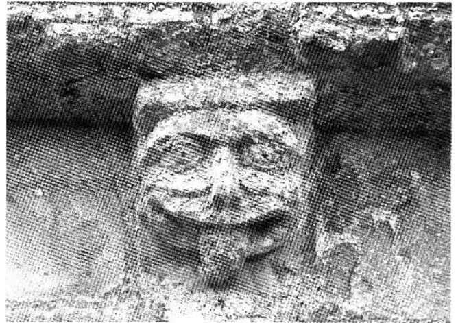
Figure 3. Corbel no. 2 (deformed head, tongue-protruder), east end under a string course, St. Nicholas, Barfreston, Kent (Photo: Barry Magrill).

where corbels occurred were not the exclusive domain of the nobility. Corbels located on the exterior of a church or a private chapel intended for the use of the lord's family were also in the public domain. Ordinary folk were free to interpret the imagery any way they saw fit, even though the clergy would likely have included the same imagery in moralizing sermons. When the ordinary folk had exited the church after the conclusion of a sermon, they encountered the carvings on the corbel table in secular space. Some of the carvings would have reinforced the moralizing messages they had just heard, while other carvings disrupted those same messages.