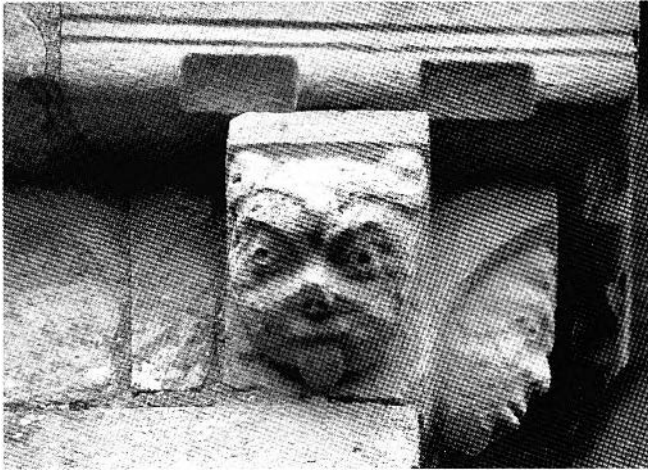
Figure 4. Corbel no. 20 of the south nave (tongue-protruder), St. Nicholas, Barfreston, Kent.