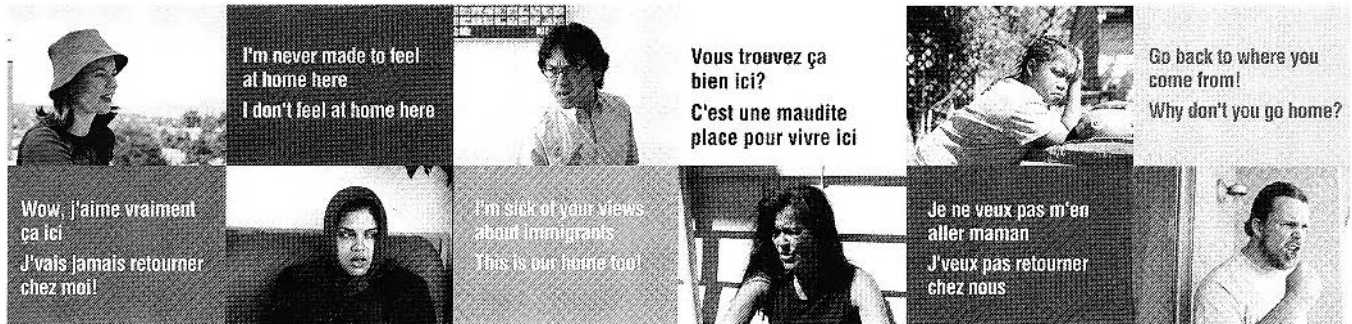
Figure 1. Ken Lum, There Is No Place Like Home , 2000. Acrylic lacquer on vinyl, 4.39 × 20.42 m (approx). Ottawa, Canadian Museum of Contemporary Photography; Collection of the artist, Vancouver; and Museum-in-Progress, Vienna.

against up-beat, flat colours such as orange, green, etc.). The materials used in this work similarly borrow from established advertising conventions for the construction of billboards: indeed, the billboard's printed vinyl sheet 2 is affixed to the gallery's exterior wall at a height appropriate for mass legibility.