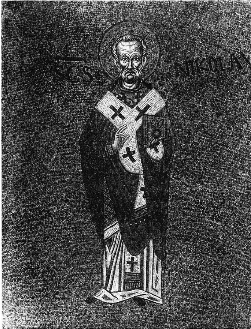
Figure 2. St Nicholas, detail of south dome of S. Marco, Venice.

beati Nicolai”, where he convened an important church council attended by 185 bishops. 19 Urban II appears to have adopted Nicholas as a personal patron saint, and it is worth noting that a church in Rome controlled by the Pierleoni family, his principal supporters in the city, was rededicated by the pontiff to Nicholas at this time. 20 Also from this period ca. 1100 come two prominent depictions of Nicholas in the mural decorations of Roman churches closely linked with proponents of the Gregorian Reform: the lower church of San Clemente and S. Maria Immacolata at Ceri, the latter located just outside the city to the northwest. 21 It is not entirely clear why the cult of this saint should subsequently have been adopted more widely by the Reform party in Rome, but such appears to have been the case. It is possible that Nicholas’ well-known acts of charity, his redemption of prisoners, and his healing miracles