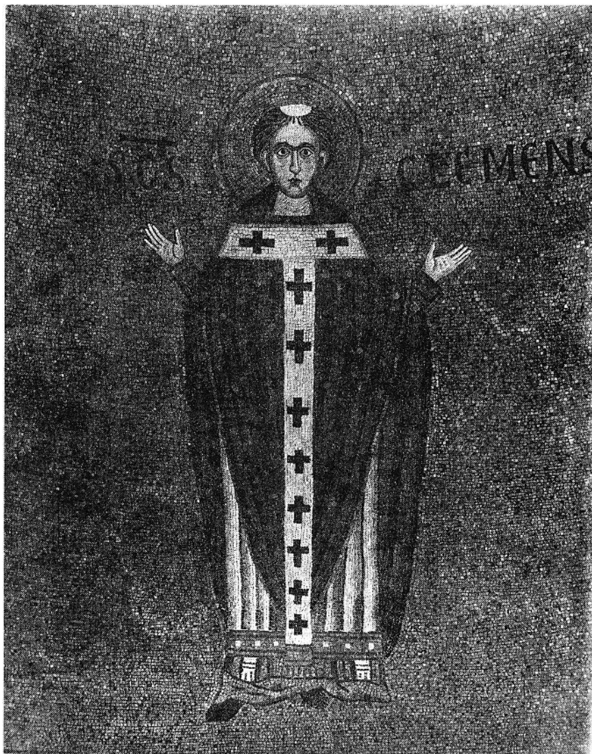
3344 Venezia - Chiesa S. Marco - Cupola del Sacramento

Of less obvious importance to Venice, but also of interest to the Reform party in Rome, were the cults of saints Blaise and Leonard. Blaise (fig. 4), a fourth-century martyr and bishop of Sebaste, 36 was another "model" bishop, famous as a healer, particularly for diseases of the throat, and perhaps also cited in the campaign against simony. 37 His veneration was introduced to western Europe at Rome in the mid-tenth century, 38 but became particularly important in the second half of the eleventh century, at which time images of Blaise were included in the mural decorations of the atrium of S. Maria Antiqua and the lower church of S. Clemente. 39 Why this interest in his cult should have blossomed remains unknown, but it may possibly be connected to the fact that Blaise was credited with having cured Pope Leo IX (1048-54), one of the primary instigators of the Reform movement, early in his career, prior to his election to the papacy. 40 At about the same time, the saint's name was introduced prominently into the liturgy of Fonte Avellana, an important centre of monastic renewal. 41 The