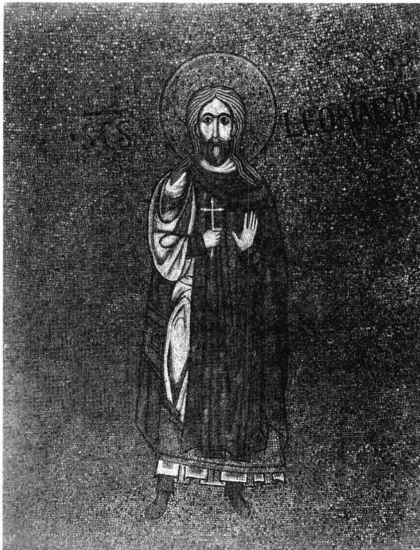
3342 Venezia - Chiesa S. Marco - Cupola del Sacramento

The most important "player" in the Gregorian Reform movement was, of course, the papacy itself, and this institution enjoyed particularly strong ties to Cluny in the second half of the eleventh century, culminating with the election of Pope Urban II, a former prior of the Burgundian abbey, in the year 1088. At first glance it might appear that the Venetians would have regarded the papacy as a natural