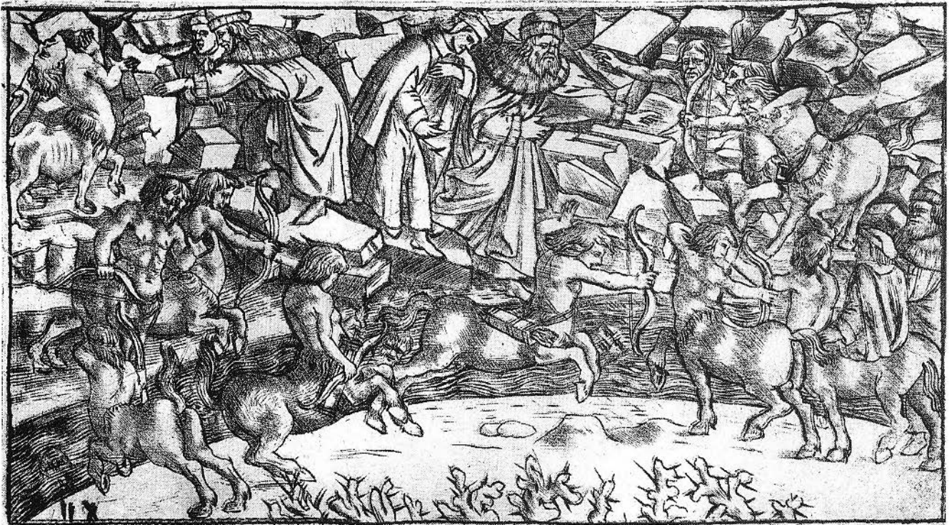
Figure 2. Inferno , Canto XII: The Punishments of the Murderers. 9.7 x 17.4 cm. (Photo: British Museum, London).

font, illustrations, disposition of text and images on the page, and inclusion of other texts to accompany the main work. The final element was the creative act of interpretation that appropriated the work in reading, so that a reader's understanding of a text was dependent on its content and presentation, but also on his or her imaginative reconstruction of the work through the deciphering of its visual and textual codes. This interpretation was obviously personal, but it is also true that any individual reader necessarily belonged to one or more "interpretive communities," that is groups of readers who shared the same reading styles and strategies of interpretation. 29