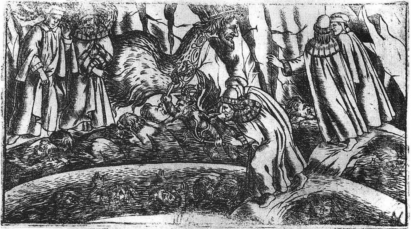
Figure 7. Inferno , Canto XVIII: The Malebolge with the Panderers and the Flatterers. 9.6 x 17.6 cm. (Photo: British Museum, London).