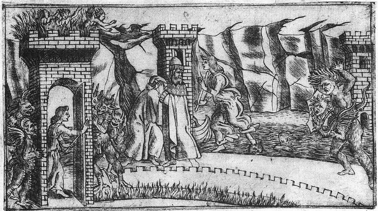
Figure 4. Inferno , Canto IX: The Styx and the City of Dis. 9.7 x 17.5 cm.

were stamped into the format of the book and the very letters of the poem.