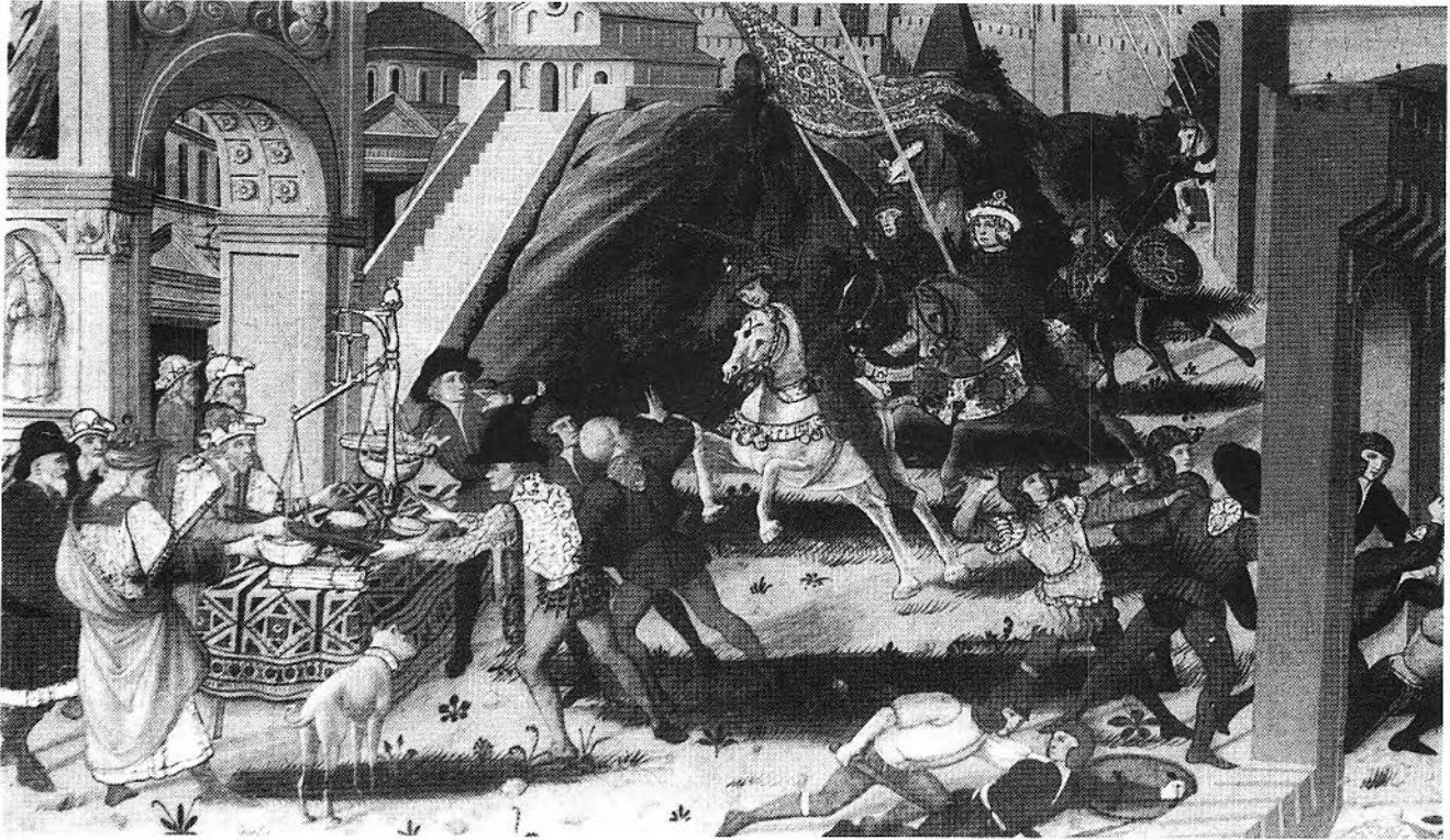
Figure 5. Zanobi di Domenico, Jacopo del Sellaio, and Biagio d'Antonio. The Morelli Cassone, central image, "The Gauls Defeated by Marcus Furius Camillus". 1472.

These illustrations must be considered another example of Florentine bravura, another attempt to outdistance technically all previous editions. But with their inclusion came a new complication, the necessity to position them in relation to the many visual representations of Dante and the Comedy which existed in the public sphere. Dante's history in Florence was not only oral and aural, it was also visual: frescoes based more or less exactly on the Inferno covered the walls of many churches, including the Strozzi Chapel in Santa Maria Novella. Even a more distant image like the fresco in the Pisa Camposanto was known through a variety of Florentine prints which circulated in the 1460s and 70s. 41 Obviously, if the poet and poem were to be distinguished from the culture of the masses, the illustrations could not be allowed to recall widely accessible images.