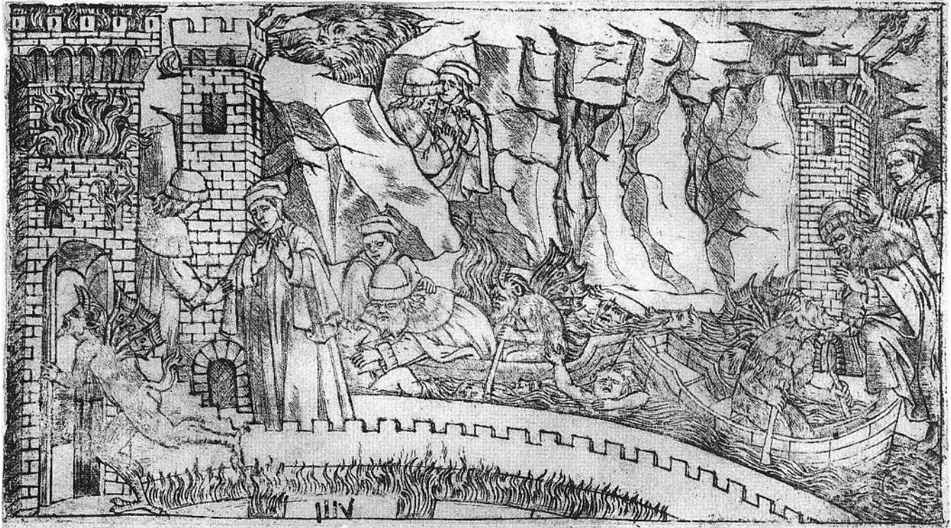
Figure 3. Inferno, Canto VIII: The Styx and the Punishments of the Wrathful. 9.6 x 17.6 cm.

that he felt it necessary to liberate “ el nostro cittadino ” from the barbarisms of non-Tuscan commentators and, through his efforts, to bring Dante’s exile to an end. About Tuscan, Landino adds: