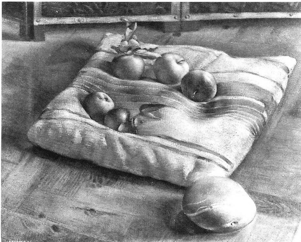
Figure 5. Second Last Painting , 1956, painting, 71.1 x 91.4 cm. Signed and dated brc.: Chambers 56. Location unknown.