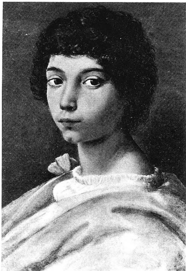
Figure 10. Giulio Romano?, Alessandro de' Medici as a Youth, ca. 1525. Oil on panel, 44 x 29.5 cm. Madrid, Thyssen-Bornemisza Collection, no. 330.

orphan. Her hand, reaching to Maria's, accords with Vives's directive to supply the guidance of an older matron for newly orphaned children. 97 Maria, as in Vasari's tondo, is portrayed in her role as mother of the Duke. Her pose and expression express her protective role over her charge.