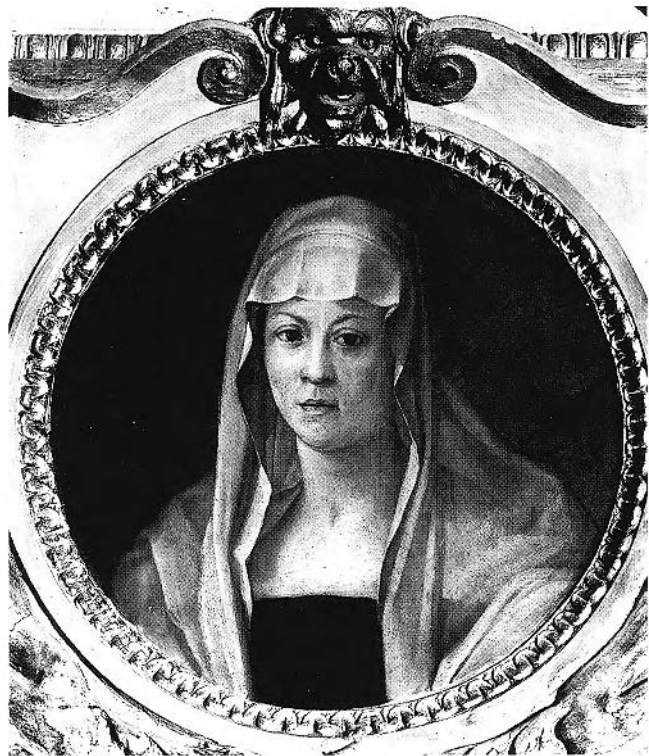
Figure 3. Giorgio Vasari, Maria Salviati de' Medici , 1556. Fresco. Sala Giovanni delle Bande Nere, Palazzo Vecchio, Florence.

against a pilaster, symbol of fortitude, fulfilling a decorum only recently prescribed by Castiglione, a sprezzatura that augments the implied courage of a potential man of arms. The pilaster may also be a veiled reference to the new Medici principato under the protection of the Emperor Charles V, one of whose imprese showed the eagle between two pillars. 29 Finally, the identity of this boy raised from birth as the legitimate Medici scion is elaborately inscribed in the upper right field, COSMO.MED.