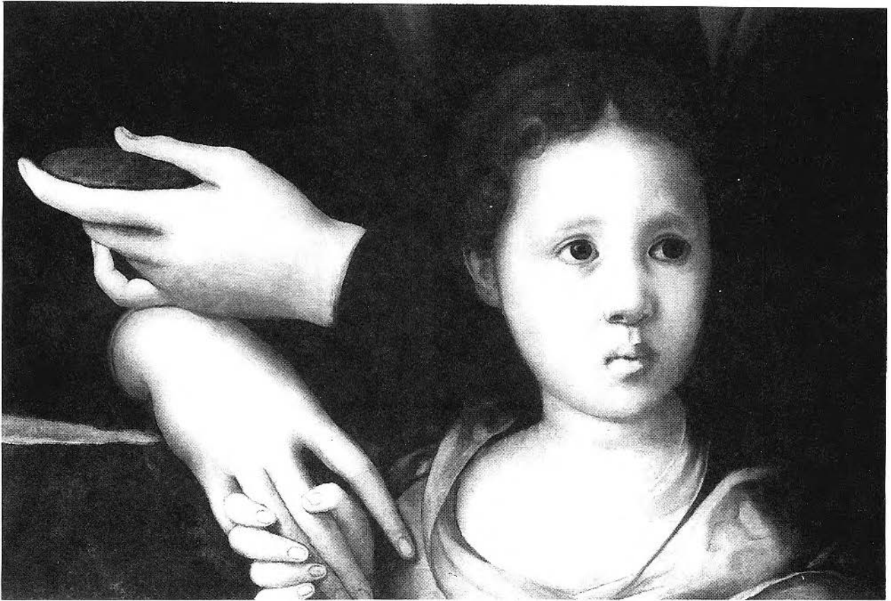
Figure 2. Pontormo (Jacopo Carucci), Maria Salviati with Giulia d'Alessandro de' Medici , circa 1540, detail, Giulia de' Medici . Baltimore, Walters Art Gallery.

This last portrait is a copy of Ridolfo Ghirlandaio's Portrait of Cosimo de' Medici at Age Twelve of 1531 (Fig. 6), and Pontormo's profile portrait of 1537 is the source for another portrait of Cosimo as a youth in this setting. Oddly, the Baltimore child does not reappear in the cycle or in any of the multiple sets of Medici family portraits commissioned by Cosimo. These include Medici children from babyhood to adolescence. 22