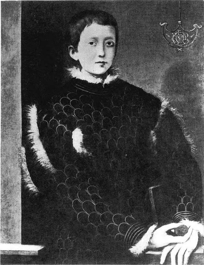
Figure 6. Ridolfo Ghirlandaio, Cosimo de' Medici at Age Twelve , 1531. Oil on panel, 86.5 x 66.5 cm. Florence, Uffizi, Inv. Ville 1911, Castello no. 274 (Photo: from G. Poggi, "Di un ritratto inedito di Cosimo de' Medici, dipinto del Ghirlandajo nel 1531," Rivista d'Arte . IX (1916-18), Fig. 1).

A star sì mesto, il suo gioir, ch'inginge In lei sempiterna, allegro Ti renda, non dirò, ma tempri in parte, La noia che comparte La carna inferma al cor doglioso. . . [sic]. 50