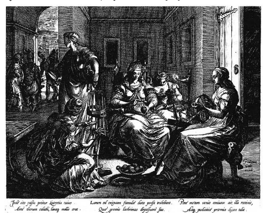
Figure 2. Hendrik Goltzius, Lucretia in the Spinning Chamber, ca. 1578. Engraving, 192 x 247 mm. Kunstmuseum Basel.

ground is sewing. All the women express utmost sincerity in their actions. The full concentration on their domestic work symbolizes their rejection of all temptation, sexual or otherwise. In the mid-sixteenth century print by the engraver H. Cock, The Parable of the Wise and Foolish Virgins , based on a design by Pieter Bruegel, 49 the Wise Virgins are occupied with the same activities as Lucretia and her maidens. In addition, one woman washes cloths in a big tub. In these prints, daily household chores symbolize virtuous behaviour. In both images, a burning candle signals night, underlining that the women resist all temptations through working, even at the dark time of seduction. The candle also refers to their praiseworthy industriousness, as with Luther's emphasis that a good wife's lantern does not go out at night. 50