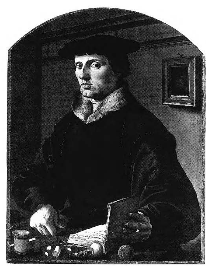
Figure 5. Maerten van Heemskerck, Portrait of a Man (Pieter Bicker?) , 1529. Panel, 86,3 x 66,4 cm. Rijksmuseum, Amsterdam.

Woman, so popular in the late fifteenth and sixteenth centuries. The flood of renderings warning against women's wiles, which lead men to destruction, completely reversed the earlier medieval view of virtuous heroines and stressed the importance of male dominance over women. The implications of the depiction of Aristotle and Phyllis, for example, shifted from anti-Aristotelianism, pure and simple, to criticism of the power of women during the fourteenth and fifteenth centuries. Northern European images of rape also underwent a change in tone and content, later ones blaming the victim instead of condemning the rapist.