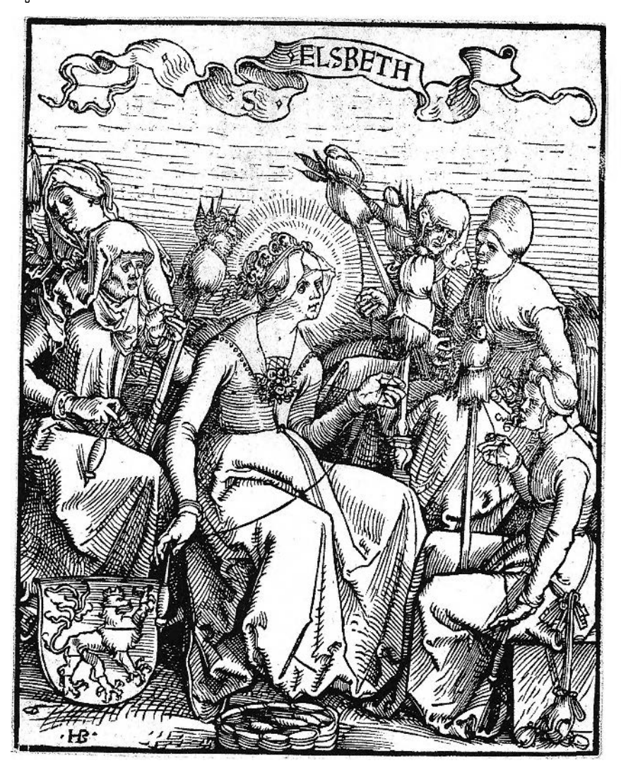
Figure 7. Hans Baldung Grien, Saint Elizabeth Spinning, 1512. Woodcut, 175 x 139 mm. Augustiner-Museum, Freiburg im Breisgau.

proximately five to ten thousand carders and spinners, most of them females who worked at home, lived in cities with a high number of weavers, such as Augsburg, Frankfurt and Ulm. 80 Although even married women of the lower social strata relied on spinning for additional income, the sexualization of images of them working was used to discredit their work. The potential independence and increasing reputation that work could otherwise provide was eliminated by relegating professional spinning to the dishonourable occupations. Consequently, female craftsmen were hardly shown in more prestigious depictions of the trades.