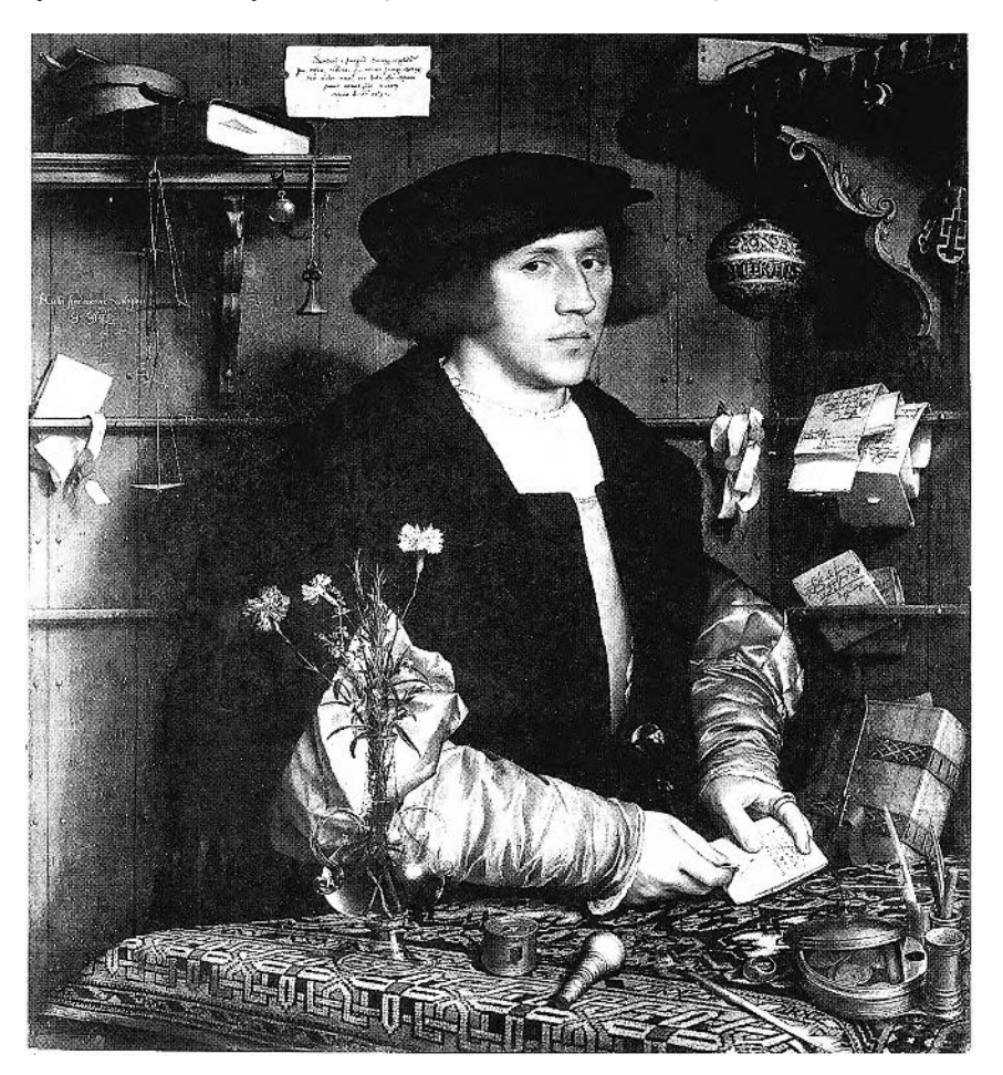
Figure 6. Hans Holbein, Georg Gisze of Danzig, 1532. Panel, 96,3 x 85,7 cm. Gemäldegalerie, Berlin.

ous web of female wiles in which, according to contemporary value schemes, a man could get caught.