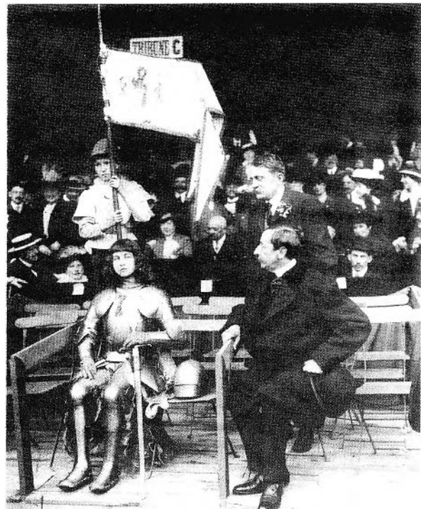
FIGURE 78. Fête de Jeanne d'Arc à Compiègne , le 8 juin 1913. Joan of Arc and, at right, Maurice Barrès.