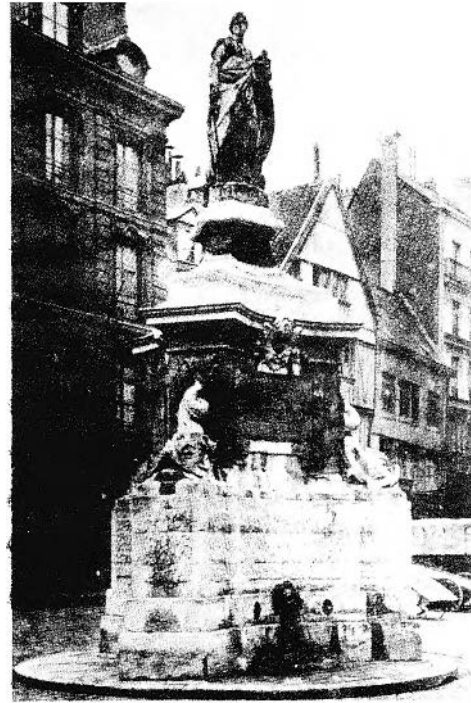
FIGURE 76. Paul-Ambroise Slodtz, Joan of Arc as Bellona , Rouen, 1755-57 (destroyed 1944).