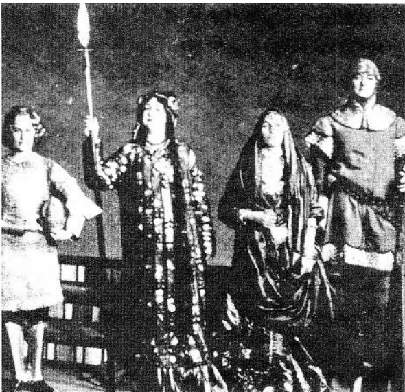
FIGURE 77. The Pageant of Great Women, at the Scala Theatre, London, 1909. "The Warriors," left to right: Joan of Arc, Boadicea, the Rani of Jhansi, Agnes Dun- bar.