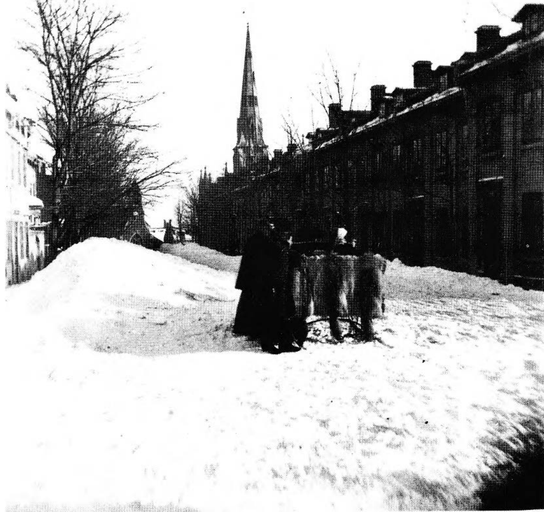
FIGURE 175. Alexander Henderson, Press Castle, Scotland, 1831-Montréal, 1913, Active, Canada, Beaver Hall, Montreal , albumen silver print from wet-collodion glass-plate negative, March 1869, 11.2 × 8.9 cm, plate 6 from Snow and Flood After Great Storms of 1869 (Montreal: Alexander Henderson, 1869). PH1981:1285:006, Collection Centre Canadien d'Architecture/Canadian Centre for Architecture, Montréal.