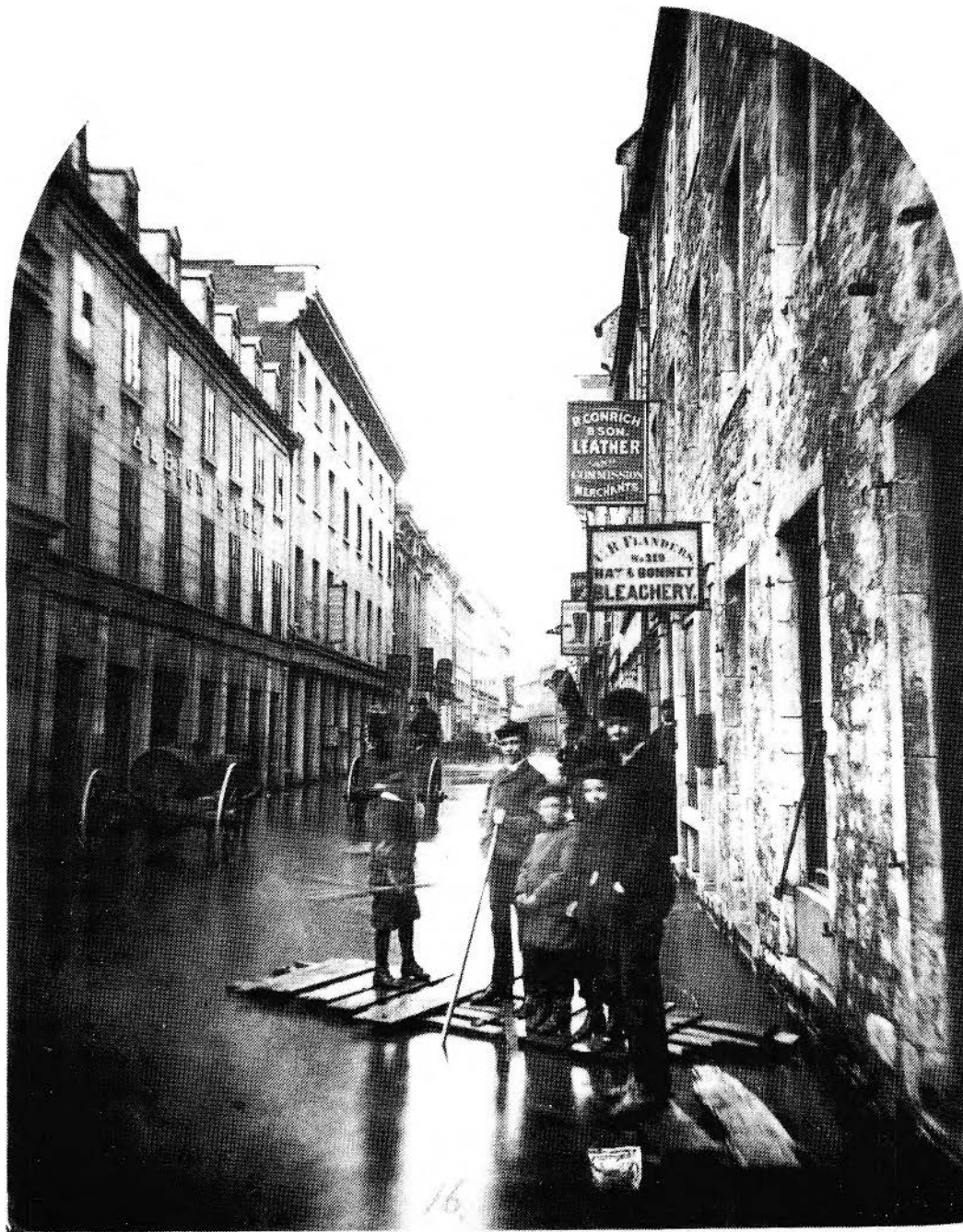
FIGURE 183. Alexander Henderson, Press Castle, Scotland, 1831-Montréal, 1913, Active, Canada, St. Paul Street, in Flood, Montreal , albumen silver print from wet-collodion glass-plate negative, April 1869, 11.3 × 8.9 cm. plate 16 from Snow and Flood After Great Storms of 1869 (Montreal: Alexander Henderson, 1869). PH1981:1285:016.