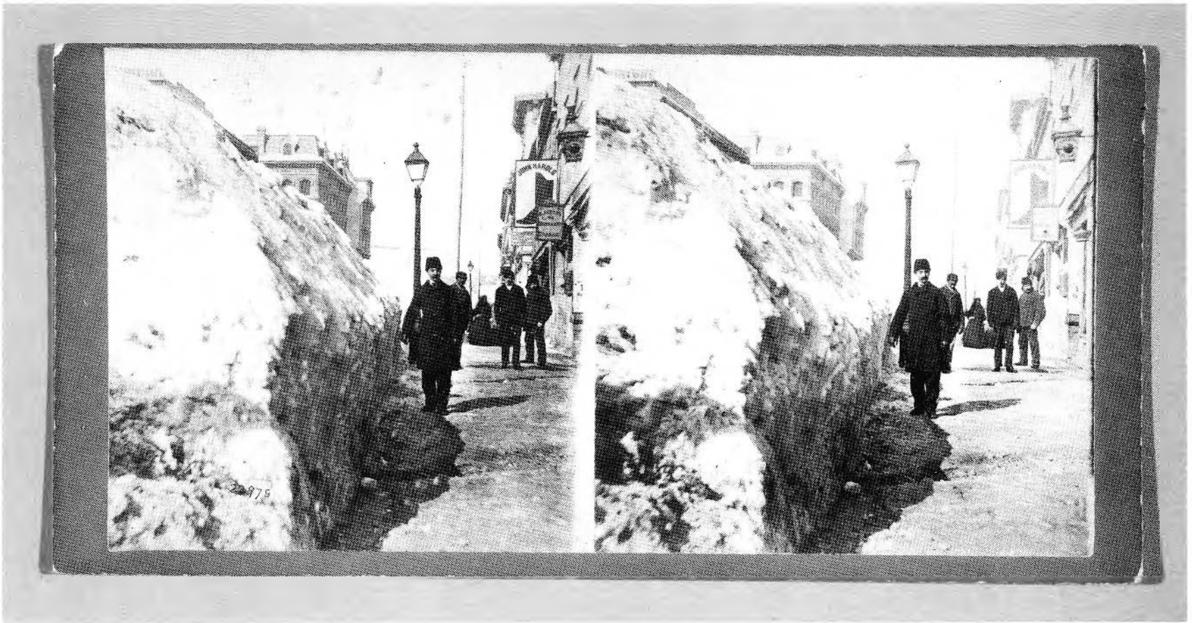
FIGURE 181. James Inglis, Scotland, 1835-Chicago, 1904, Active, Canada and the United States, McGill Street, Montreal , stereograph (two albumen silver prints from a wet-collodion glass-plate negative), March 1869, 7.8 × 7.7 cm (each image).