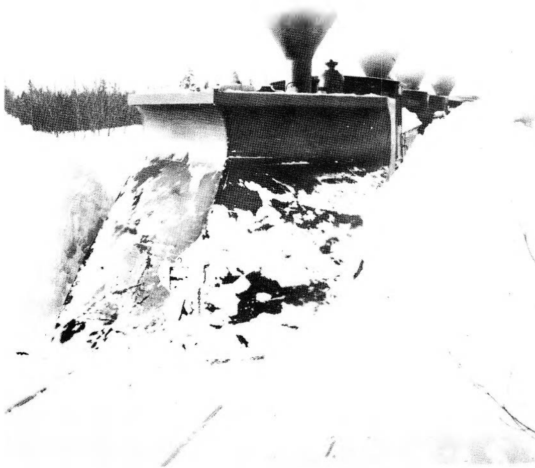
FIGURE 174. Alexander Henderson, Press Castle, Scotland, 1831-Montréal, 1913, Active, Canada, Engines clearing the track, G.T.R. , albumen silver print from wet-collodion glass-plate negative, 1869, 11.2 × 8.9 cm, plate 1 from Snow and Flood After Great Storms of 1869 (Montreal: Alexander Henderson, 1869). PH1981:1285:001, Collection Centre Canadien d'Architecture/Canadian Centre for Architecture, Montréal.