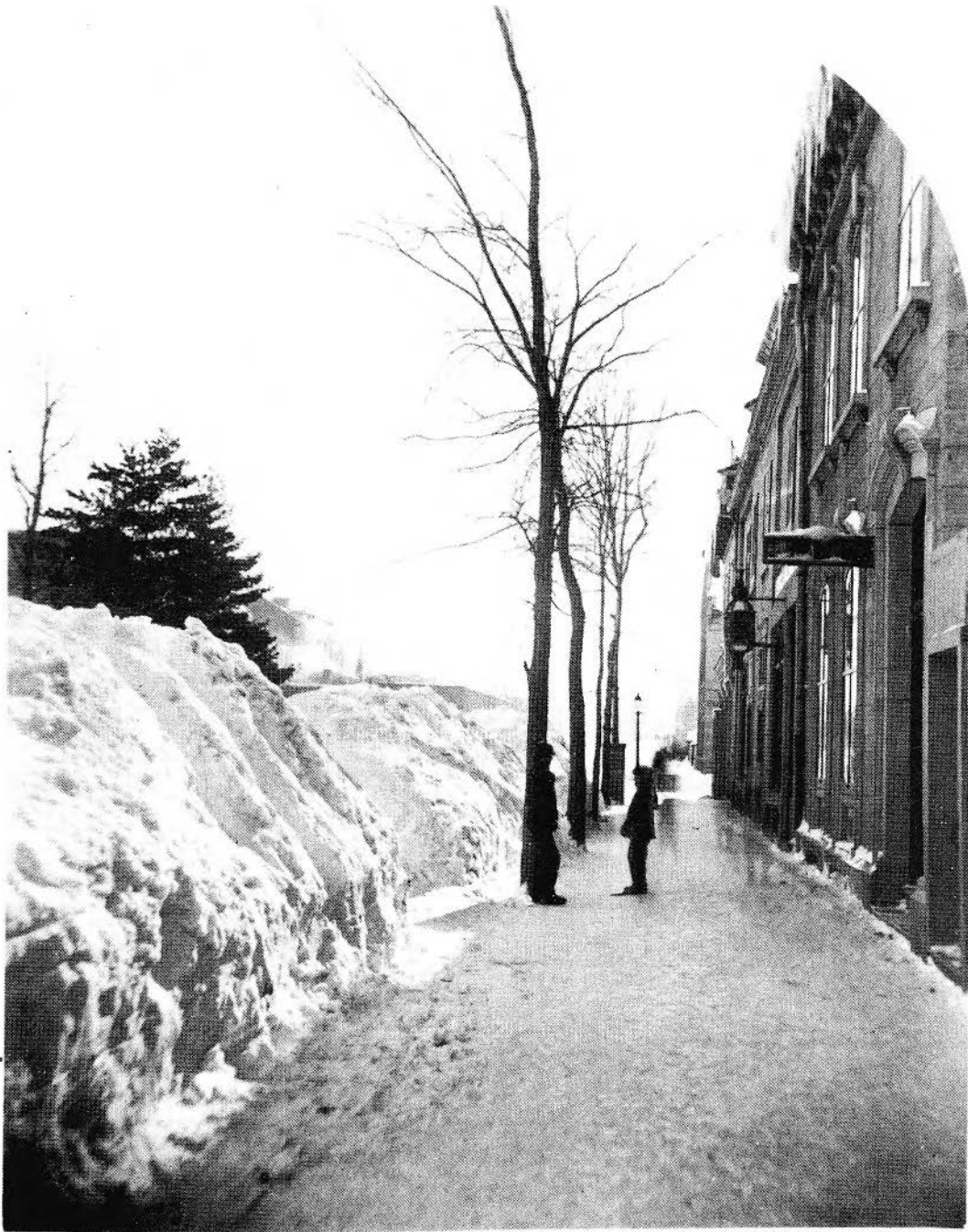
FIGURE 176. Alexander Henderson, Press Castle, Scotland, 1831-Montréal, 1913, Active, Canada, Phillips Square, Montreal , albumen silver print from wet-collodion glass-plate negative, March 1869, 11.3 × 8.9 cm, plate 7 from Snow and Flood After Great Storms of 1869 (Montreal: Alexander Henderson, 1869). PH1981:1285:007, Collection Centre Canadien d'Architecture/Canadian Centre for Architecture, Montréal.