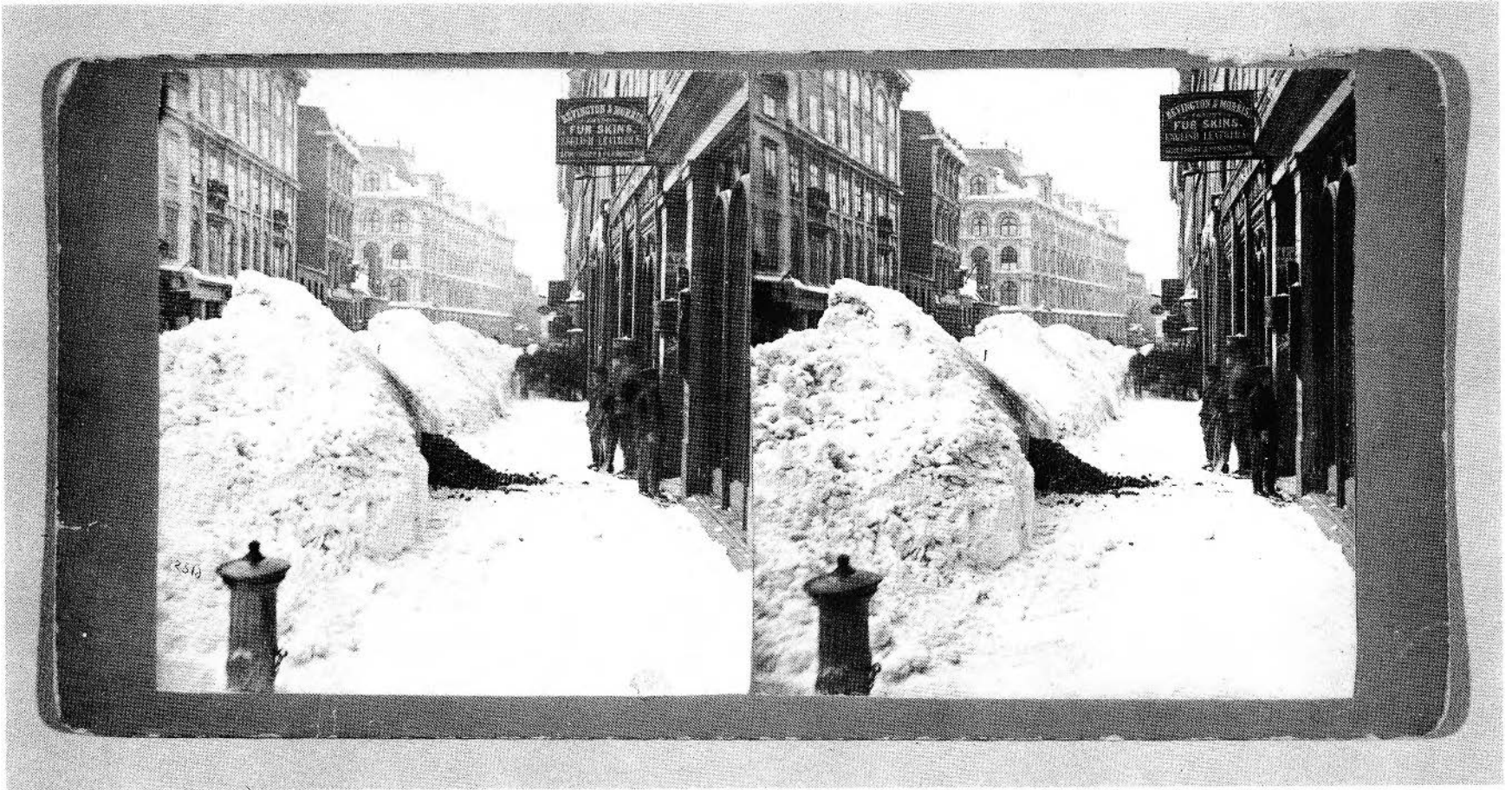
FIGURE 179. Alexander Henderson, Press Castle, Scotland, 1831-Montréal, 1913, Active, Canada, St. James Street, Montreal , stereograph (two albumen silver prints from wet-collodion glass-plate negative), March 1869, 7.9 × 7.5 cm (each image).