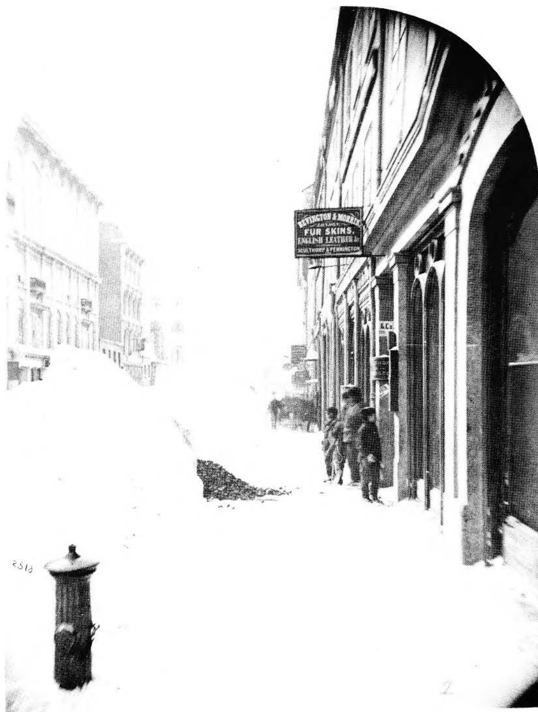
FIGURE 178. Alexander Henderson, Press Castle, Scotland, 1831-Montréal, 1913, Active, Canada, Great St. James Street, Montreal , albumen silver print from wet-collodion glass-plate negative, March 1869, 11.7 × 8.9 cm, plate 2 from Snow and Flood After Great Storms of 1869 (Montreal: Alexander Henderson, 1869). PH1981:1285:002, Collection Centre Canadien d'Architecture/Canadian Centre for Architecture, Montréal.