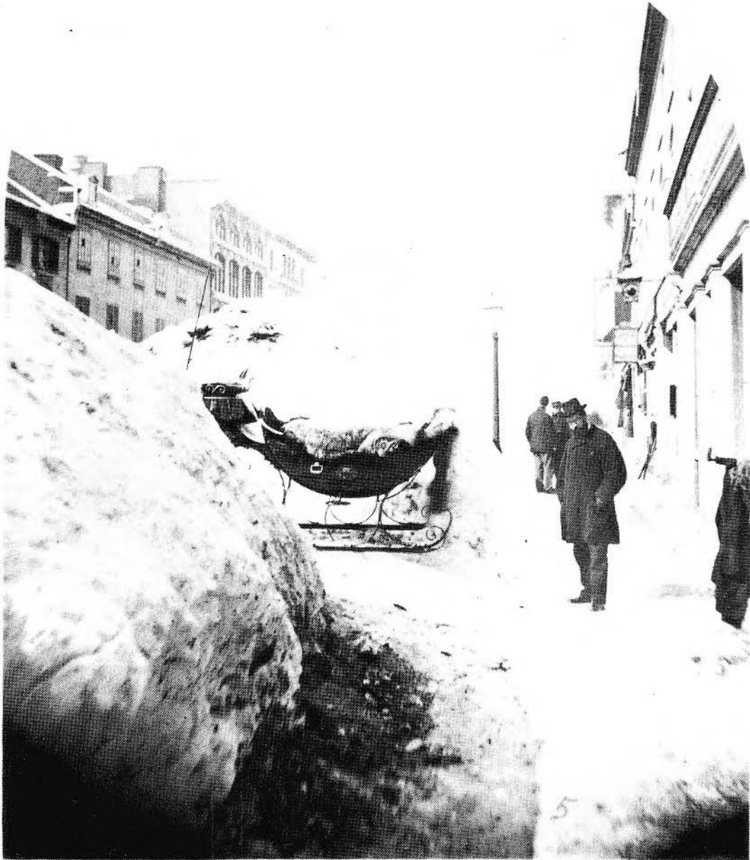
FIGURE 180. Alexander Henderson, Press Castle, Scotland, 1831-Montréal, 1913, Active, Canada, McGill Street, Looking Upwards, Montreal , albumen silver print from wet-collodion glass-plate negative, March 1869, 10.9 × 8.9 cm, plate 5 from Snow and Flood After Great Storms of 1869 (Montreal: Alexander Henderson, 1869). PH1981:1285:005, Collection Centre Canadien d'Architecture/Canadian Centre for Architecture, Montréal.