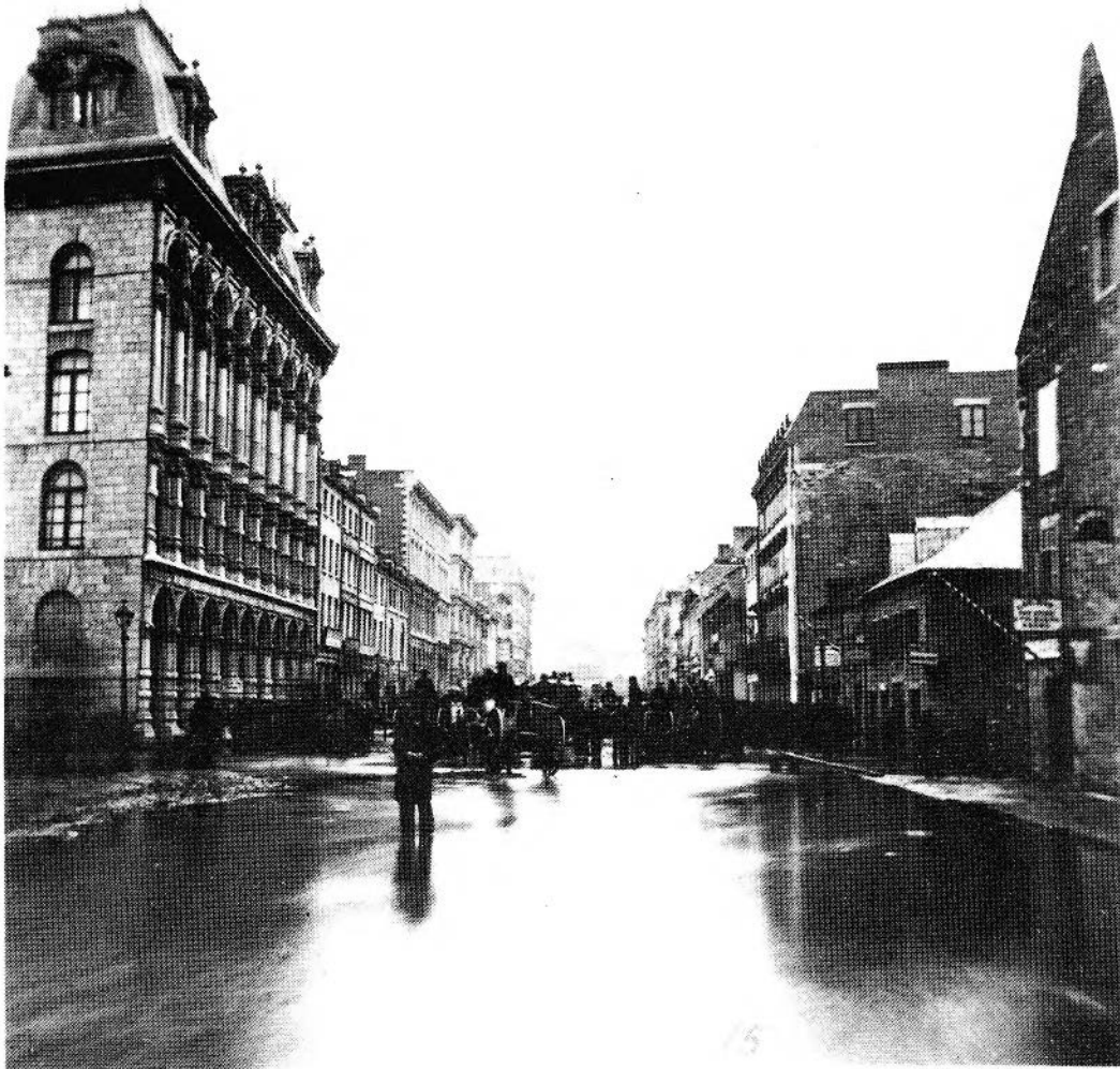
FIGURE 177. Alexander Henderson, Press Castle, Scotland, 1831-Montréal, 1913, Active, Canada, Spring Flood in McGill Street, Montreal , albumen silver print from wet-collodion glass-plate negative, April 1869, 10.1 × 8.9 cm, plate 15 from Snow and Flood After Great Storms of 1869 (Montreal: Alexander Henderson, 1869). PH1981:1285:015, Collection Centre Canadien d'Architecture/Canadian Centre for Architecture, Montréal.