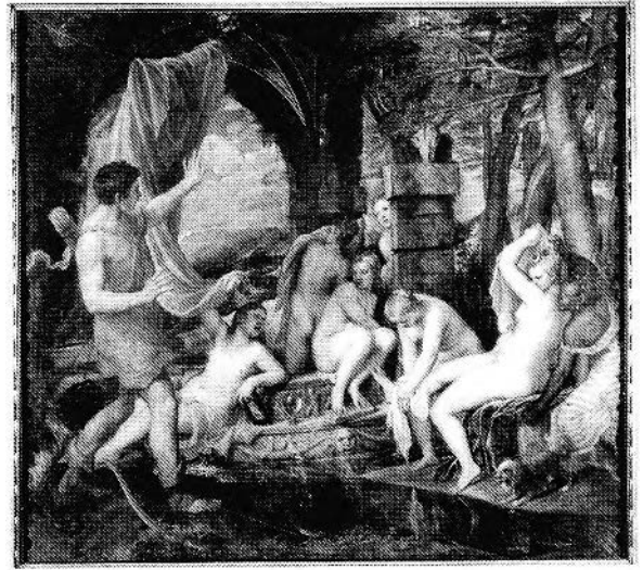
FIGURE 101. Titian, Diana and Actaeon , Duke of Sutherland Collection, on loan to the National Gallery of Scotland.