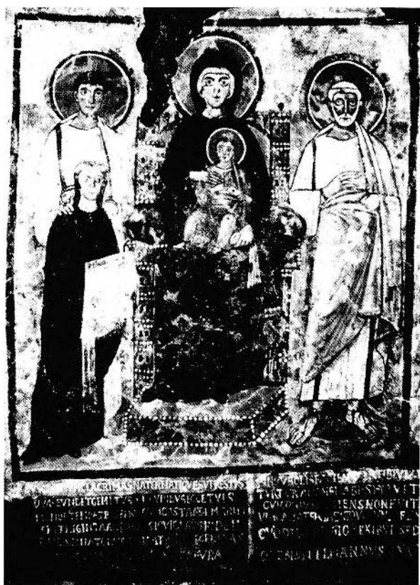
FIGURE 1. Tomb of Turtura, Catacomb of Commodilla, Rome (Photo: Pontificia Commissione di Archeologia Sacra).

Shortly after the burial of Turtura in the Catacomb of Commodilla, the suburban catacombs ceased to be used for their original purpose as places of burial. This shift from cemeteries outside the city to cemeteries within the perimeter of the Aurelian walls was complete by the second half of the 6th century,