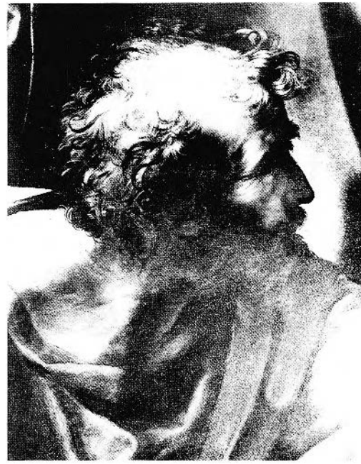
FIGURE 6. Raphael, Head of an apostle, detail from the Transfiguration . Vatican.