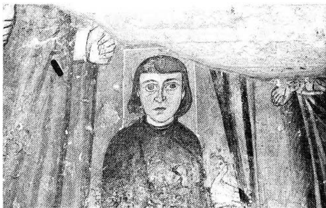
FIGURE 3. Family of Theodotus, detail. Rome, Theodotus chapel, S. Maria Antiqua, 741-752 A.D. Krautheimer, pl. 85.

Trastevere), and the 'disabitato,' the large stretches of land inside the Aurelian walls which lay abandoned or were used for crops or pasture. An entire chapter is devoted to the one mediaeval addition to the physical area occupied by the city: the Borgo. It is in some respects comforting to learn that the plethora of tourist stalls in the streets around St. Peter's were if anything more profuse in the thirteenth century than they are today.