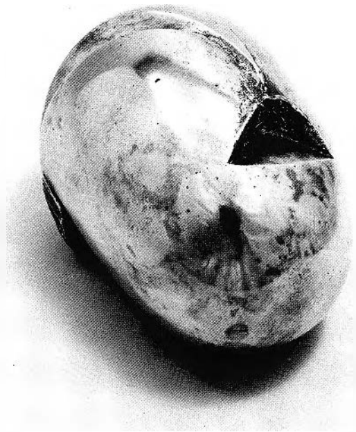
FIGURE 3. Constantin Brancusi, The First Cry , 1917 (cat. 58). Polished bronze, edition of three, L. 17.3 cm. The Art Gallery of Ontario.