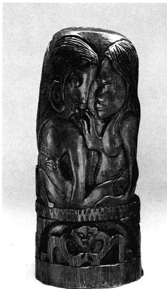
FIGURE 1. Paul Gauguin, Hina and Te Fatou, 1892 (cat. 12). Tamanu wood, h. 32.7 cm. The Art Gallery of Ontario.