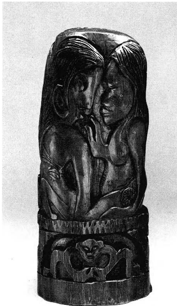
FIGURE 1. Paul Gauguin, Hina and Te Fatou, 1892 (cat. 12). Tamanu wood, h. 32.7 cm. The Art Gallery of Ontario.