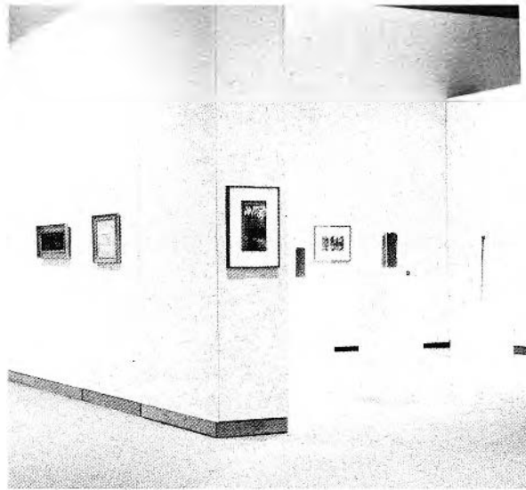
FIGURE 4. Gauguin to Moore: Primitivism in Modern Sculpture . Installation view at the Art Gallery of Ontario.

sculptural richness of the non-European traditions and introduce it to Europe. He devoted a great deal of his artistic creativity to carving and ceramic sculpture (a fact little known to the general public). It is noteworthy that this was the first time since the Gauguin retrospective of 1906 in Paris that so many of that artist's sculptures have been seen together in one place. Thirteen wood carvings and one terracotta figure appeared in this show, one from the National Gallery of Canada, The Bust of Meyer de Haan , 1889 (cat. 6). Barrel , 1889 (cat. 1) is from a private Canadian collection, while Hina and Te Fatou , 1892 (cat. 12) belongs to the AGO.