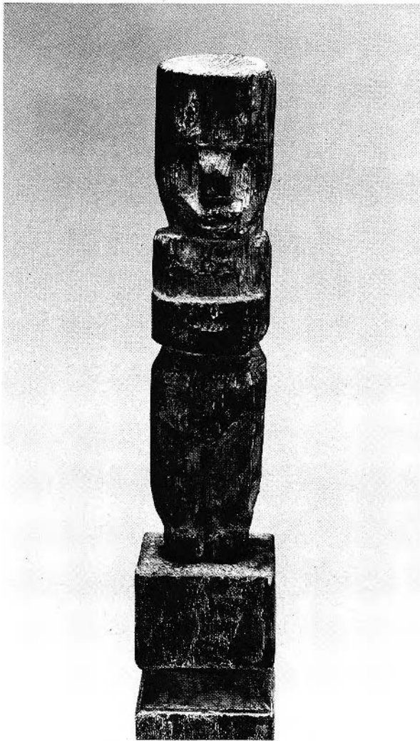
FIGURE 2. Pablo Picasso, Poupée , 1907 (cat. 46). Wood, polychrome, metal eyes, h. 26 cm. The Art Gallery of Ontario.

As the title implies, the exhibition began with Gauguin and ended with Moore. The largest number of sculptures was devoted to these two artists. A number of Moore sculptures and related drawings from the AGO were also included; almost one-quarter of the exhibition space featured Gauguin, whose career was divided into two sections: the Breton and Polynesian periods. Gauguin was one of the first to appreciate the