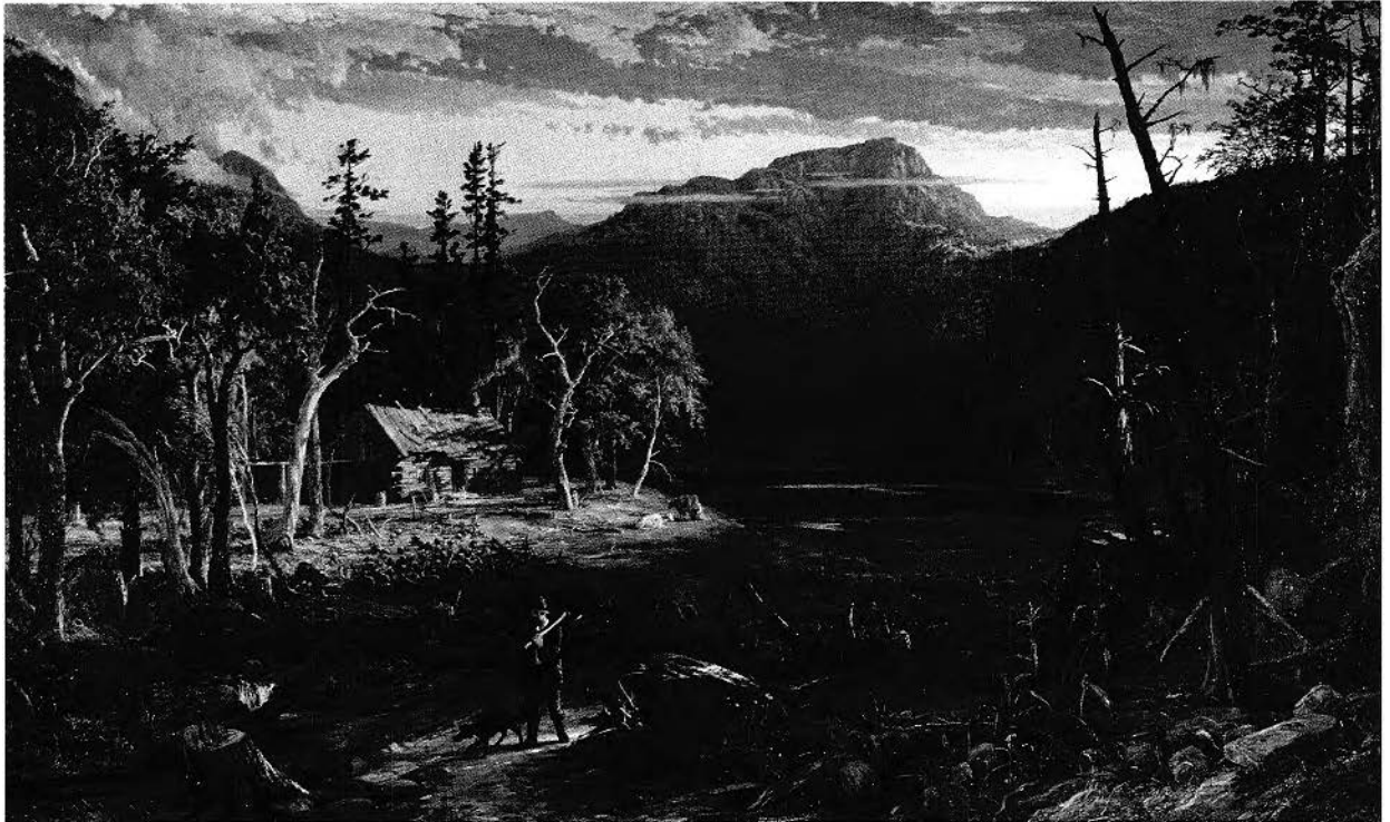
FIGURE 1. Jasper F. Cropsey, The Backwoods of America, 1858. Oil on canvas, 107.3 × 177.8 cm. Ex collection McIntosh Art Gallery, London, University of Western Ontario, Inv. 221. Private collection.

to the United States. 12 Although the first half of the 1850s was only mildly successful for the maturing artist, now 'certified' by European experience, the years between his return to New York in mid 1849 and the summer of 1856 had not seen all the personal and professional gains he had wished to make. In June 1856, he again sailed for England and soon after arriving set up the Kensington studio at London, where he worked until 1863.