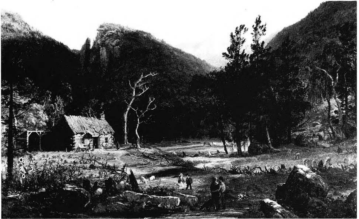
FIGURE 4. Jasper F. Cropsey, Eagle Cliff, Franconia Notch, N.H. , 1858. Oil on canvas, 61 × 99 cm. Raleigh, North Carolina Museum of Art, Inv. 52.9.9.

garden patch with its rail fence are closely alike, while the figures of mother and child at the doorstep are identical. The Raleigh picture alters the monotony of the Boston composition by shifting the cabin from dead centre to left, causing the artist to forgo topographical accuracy in reversing the jutting rock formation of Eagle Cliff to maintain alignment with the building's doorway. 22 The sharp light contrasts in the Boston landscape are somewhat softened in the later Raleigh painting, bringing it closer still to the atmospheric rendering in The Backwoods of America . Still present, however, are the clumsiness in scale relationships and in figure drawing, lifelong weaknesses in Cropsey's art. Comment that 'the foreground details of vegetables should not only be pictorially but aesthetically subordinate ... in the presence of this towering grandeur of mountain,' 23 a criticism originally applied to the Boston painting, remains unheeded in the artist's