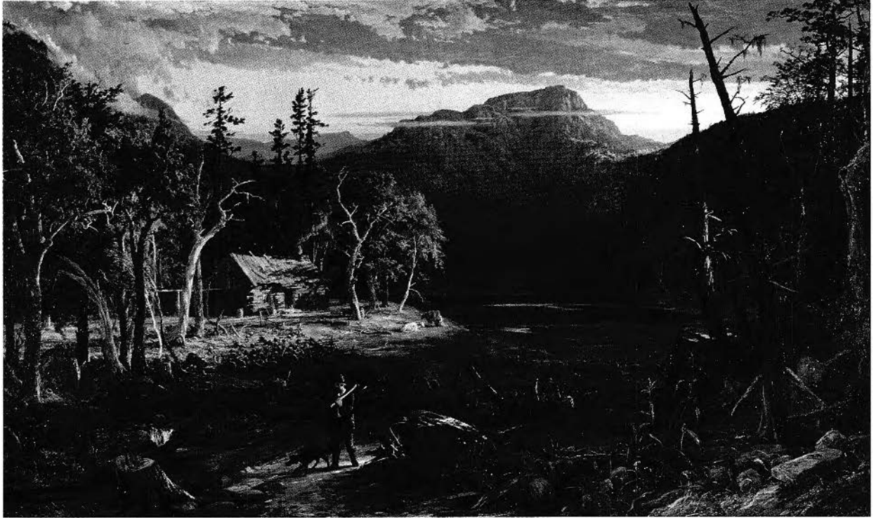
FIGURE 1. Jasper F. Cropsey, The Backwoods of America, 1858. Oil on canvas, 107.3 × 177.8 cm. Ex collection McIntosh Art Gallery, London, University of Western Ontario, Inv. 221. Private collection.

to the United States. 12 Although the first half of the 1850s was only mildly successful for the maturing artist, now 'certified' by European experience, the years between his return to New York in mid 1849 and the summer of 1856 had not seen all the personal and professional gains he had wished to make. In June 1856, he again sailed for England and soon after arriving set up the Kensington studio at London, where he worked until 1863.