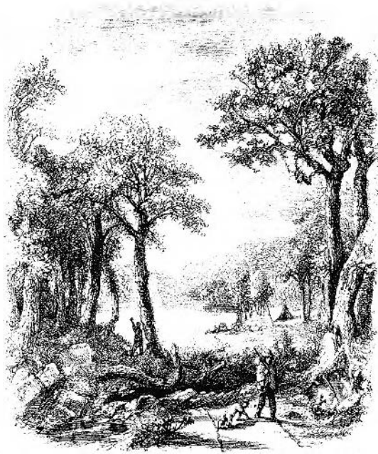
ROOM, BOYS, ROOM.