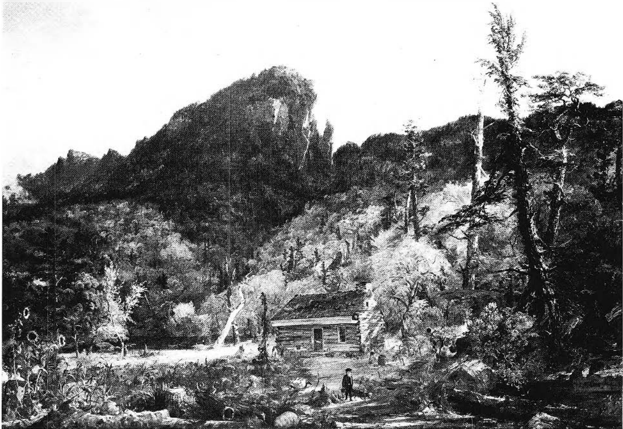
FIGURE 3. Jasper F. Cropsey, Eagle Cliff, New Hampshire , 1851. Oil on canvas, 94 × 134.6 cm. Boston, Museum of Fine Arts, Inv. 47.1190, M. & M. Karolik Collection.

From the 1840s onward Cropsey joined fellow painters of the Hudson River School in numerous trips to favourite spots in New Jersey and in the Catskill and New Hampshire mountains, seeking