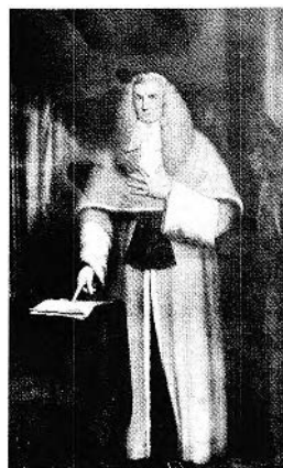
FIGURE 5. John Poad Drake, Chief Justice Samuel Salton Blowers , c. 1820. Oil painting, approximately 244 × 152 cm. Halifax County Court House, Halifax, Nova Scotia.

optimistic view of the possibilities for the fine arts as represented by the Exhibition, and an appreciation of its moral and philosophical effects. Though one might in hindsight legitimately question the mentality behind cultural ideals which praised efforts by native artists to copy European originals (since most local work did consist of such works) instead of looking within for inspiration, one must recall that painting was as yet a novelty to most of the students, as well as to most of the visitors to the Exhibition. The community-wide appreciation of the event, evident in the notices which appeared in various newspapers during the month of May, as well as in the Halifax Monthly Magazine , can also be looked at as an indication of the growth of cultural awareness and development. Such awareness did not spring up overnight, but the 1830 Exhibition was the first large step in its serious development and later consolidation.