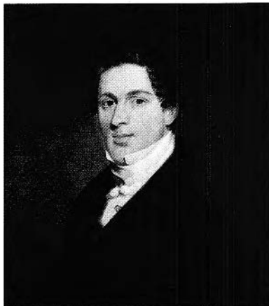
FIGURE 7. William Valentine, Portrait of a man , 1827. Oil painting, 43.2 × 38.1 cm. National Gallery of Canada.

gion.' Once more, the allusion is made to the fine arts as a morally uplifting element in the community, with greater directness than before. Even leaving that aside, the 1831 exhibition still remains an impressive effort on the part of the Halifax community.