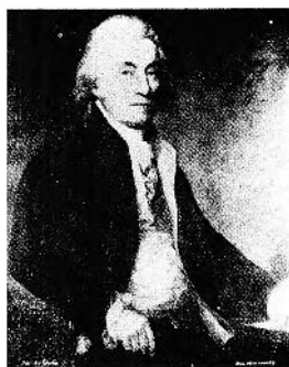
FIGURE 4. Robert Field, Sir John Wentworth, Bart. , c. 1810. Oil painting, 107.8 × 87.2 cm. Government House, Halifax.