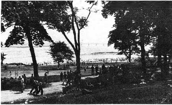
FIGURE 1. Frederick Todd, Bathing Beach, St. Helen's Island Park, Montréal. From The McGill News , Summer 1938.

do a regular day's work. Fresh from the relief rolls many of them at first presented a discouraged, undernourished appearance and found it difficult to do a full day's work, but after two or three weeks their discouraged and beaten aspect disappeared.'