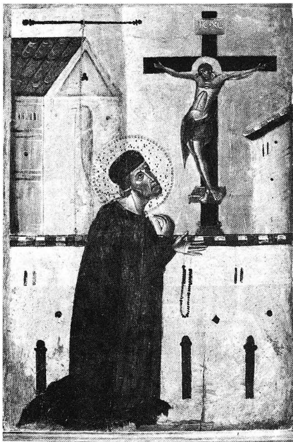
FIGURE 3. School of Guido da Siena, Beato Andrea Gallerani in Prayer (detail), late 13th century. Siena, Pinacoteca.

able if we consider the crucifix as a painter's response to the polychromed wooden sculpture of, for example, Giovanni Pisano. 9 On the other hand we do have some evidence for the existence, at an even earlier date, of cut-away forms. That evidence comes from other pictures and perhaps for this reason it has passed unnoticed. The critical work is the fresco of the Verification of the Stigmata of St. Francis (Fig. 2) in the upper church of San Francesco, Assisi. There has been considerable discussion of the panel of the Madonna and Child and of the Crucifix which appear on the iconostasis above the figures but, to my knowledge, the much more unusual image of St. Michael Archangel has passed almost without