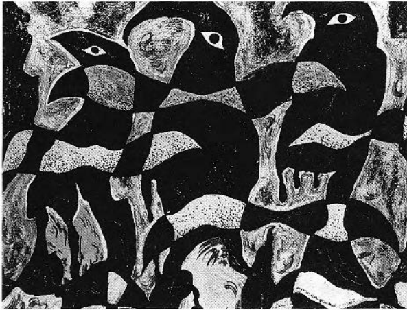
FIGURE 5. J.W.G. Macdonald, Mythical Birds , 1955. Private collection (Photo: VIDA/Saltmarche).