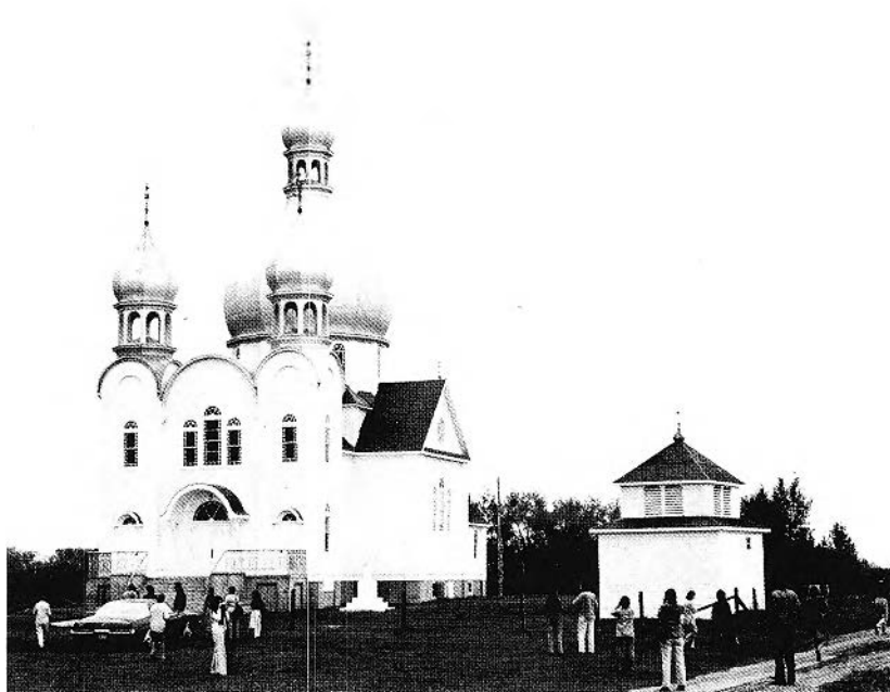
FIGURE 2. SSAC members visiting the Ukrainian Orthodox Church, St. Julien, Saskatchewan (Photo: W.A.S. Sarjeant).

Canada. The truly Ukrainian buildings of the western provinces stemmed essentially from the first phase of settlement, between 1891 and 1914. The settlers were Galician and Bukovinan peasants coming not from the steppes, as popularly supposed, but from wooded areas: they consequently avoided the open prairie and settled instead in the aspen parklands belt. 'Frame-and-fill' construction techniques used in the Ukraine, where good timber was expensive, were appropriate also in western Canada, where such timber was simply not available. Vertical lumbering, a new feature, was employed where the timber was particularly poor. The Bukovinians belonged to the Greek Orthodox church; they built houses that were thatched, with hipped gables, two roof vents, a central chimney, and flared eave-brackets, and they preferred greens in their colour scheme. The Galicians belonged to the Greek Catholic church; they built smaller houses with gables and a central chimney, less characteristic and more Germanic in appearance, emphasizing blue colours.