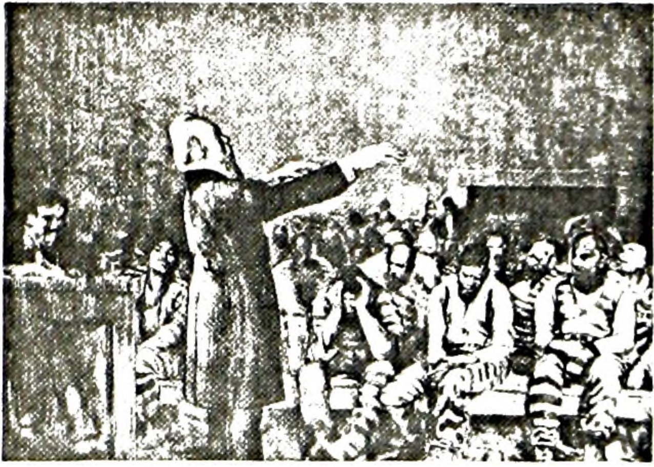
FIGURE 1. Bellows, Benediction in Georgia . Mason, p. 53.

Bellows was an accomplished lithographic artist. Between 1916 and 1924 he drew 193 lithographs, all monochromatic and nearly all drawn directly on the stone. He claimed that he was rehabilitating the medium of lithography from the stigma of commercialism which had overwhelmed it in the second half of the nineteenth century, and there is a large kernel of truth in his claim. He was indeed the first major American artist in the twentieth century to make a reputation as a printmaker by working in the medium. Nevertheless it is an exaggeration to leave the impression, as does the book at hand, that the medium had fallen into total disuse as a fine art medium and that Bellows single-handedly revived it. (He was not alone – John Sloan, for example, who made some admirable lithographs even earlier than Bellows, merits some credit.) Still, Bellows was undeniably foremost among a number of American artists participating in what proved to be a world-wide revival of the medium, and his prints, more than any others, restored lustre to lithography's reputation as a fine art process in America.