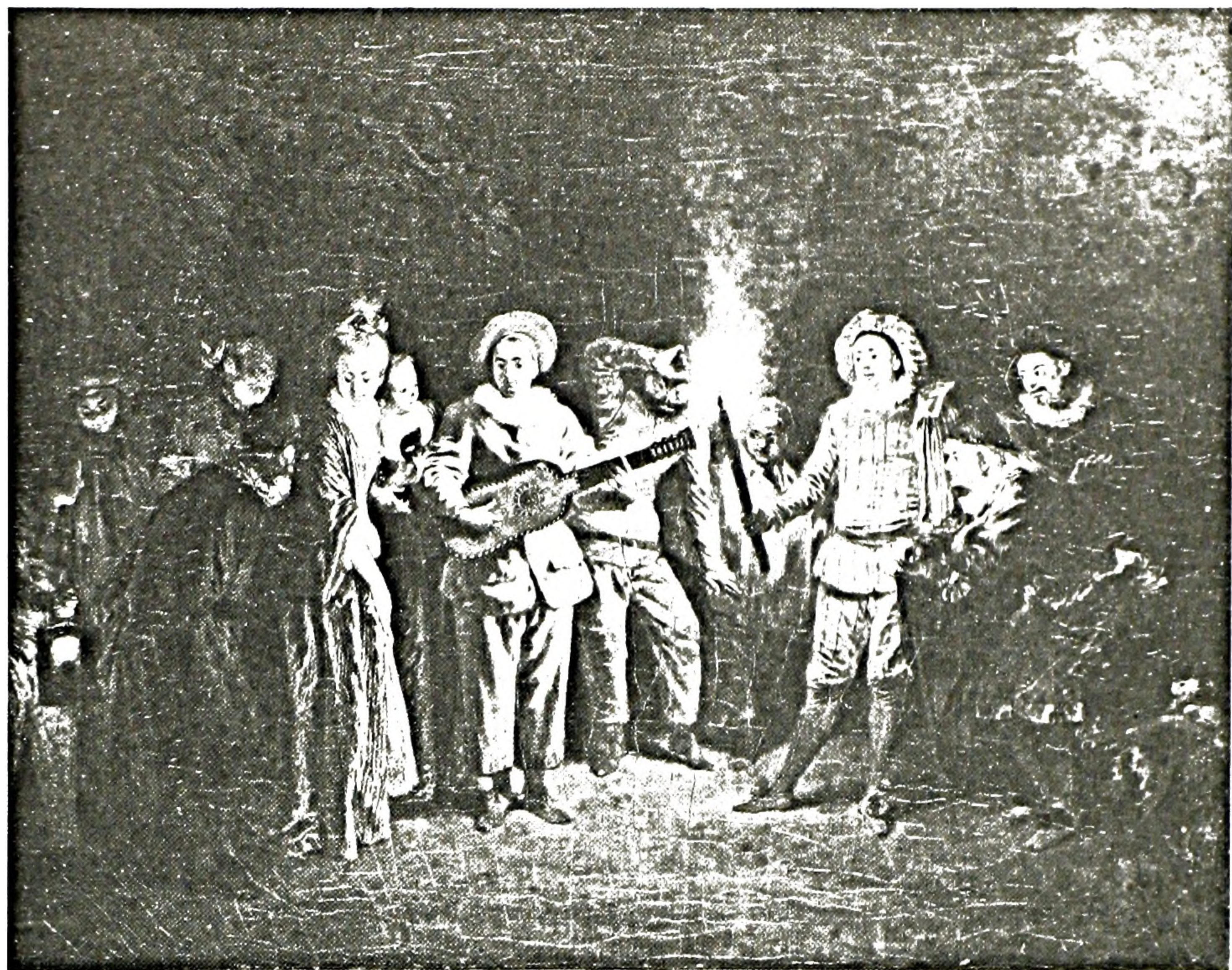
FIGURE 5. A. Watteau, L'Amour au Théâtre Italien, ca. 1716. Berlin-Dahlem, Staatliche Museen Preussischer Kulturbesitz, Gemäldegalerie.

head held by Il Matto and are pulled apart by the children, a memento mori . This action may also be interpreted as a symbol of Fate: 'Il m'aime, un peu, beaucoup, à la folie.'