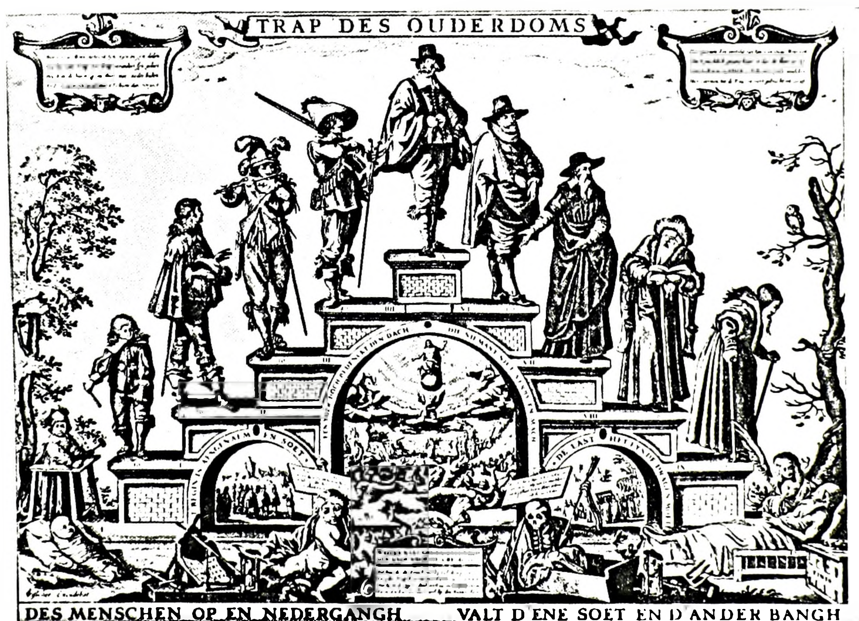
FIGURE 3. J.C. Visscher, Steps of Life , 17th century.