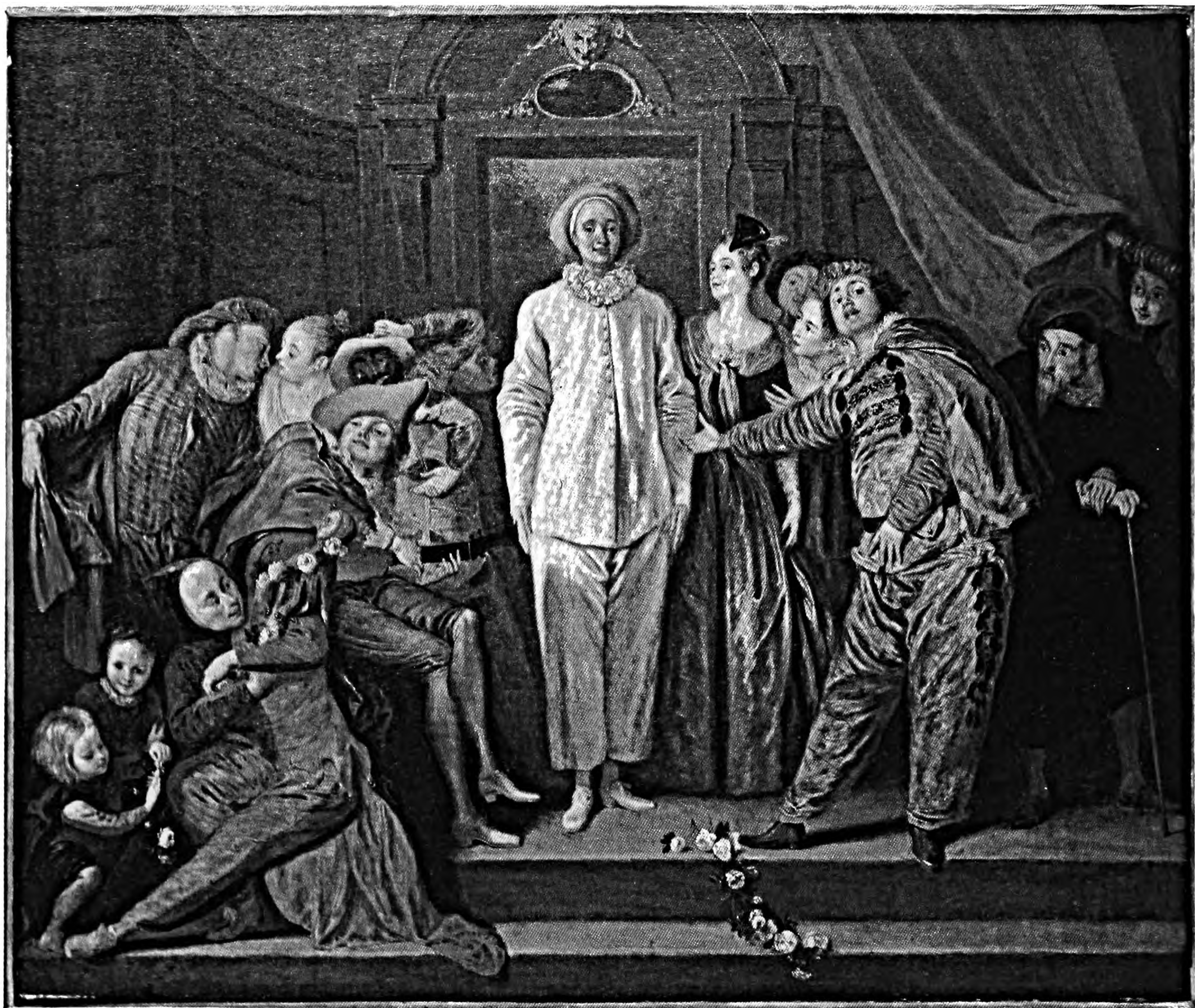
FIGURE 1. Antoine Watteau, Les Comédiens Italiens , ca. 1720. 64 × 76 cm. Washington, National Gallery of Art.

group of children and Il Matto are located on the lowest 'step' of the picture, and seem mutually to reinforce what, in my opinion, is the underlying meaning of the painting: that Watteau's assembly of figures in Les Comédiens Italiens was founded on