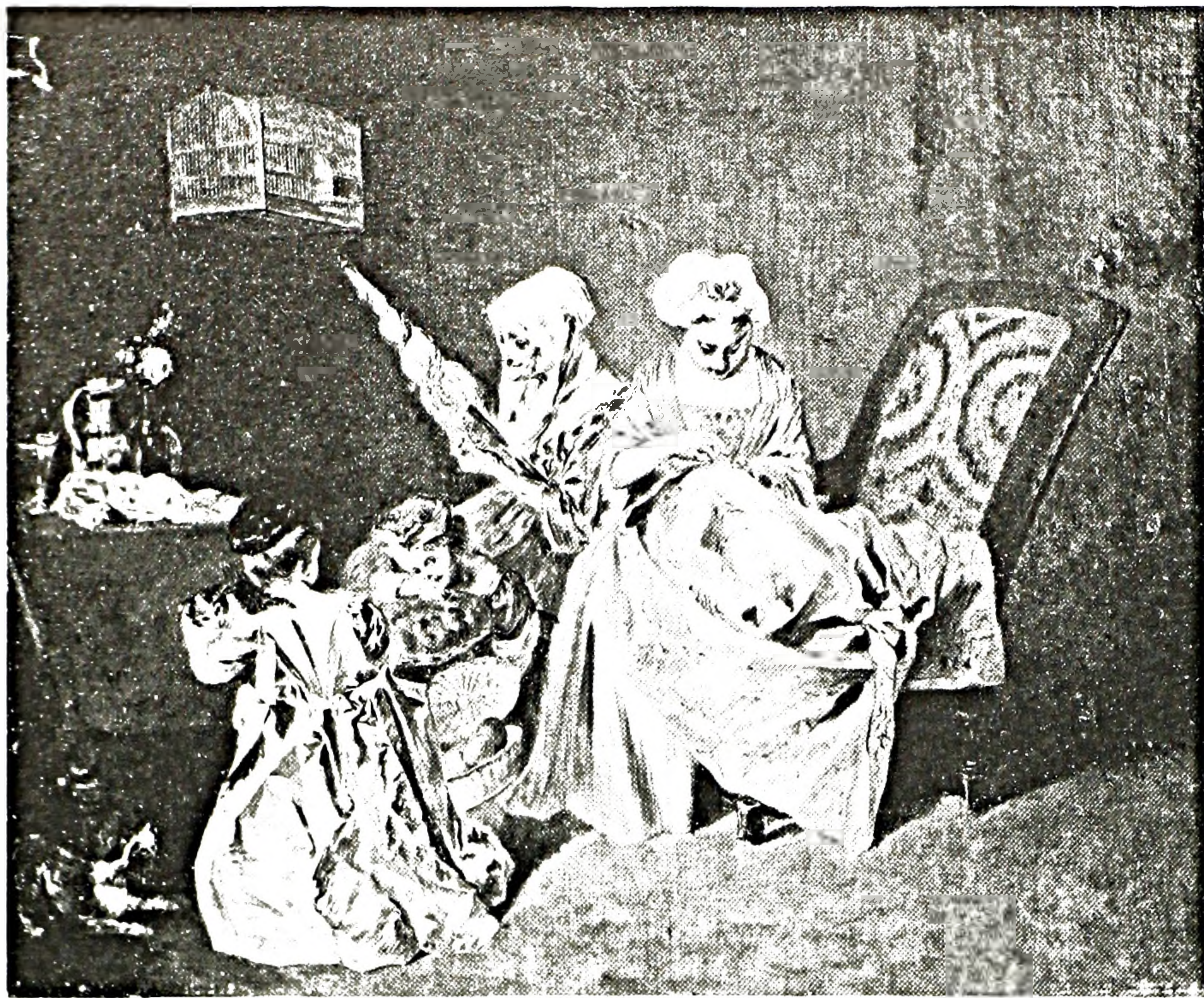
FIGURE 4. A. Watteau, L'Occupation selon l'âge , ca. 1718. Dublin, National Gallery of Ireland.

In Les Comédiens Italiens , not only does the general configuration resemble the frieze-like arrangement of the Steps of Life , but the steps in the foreground are also surely more than mere indications of the stage. They allusively prefigure the symbolic Steps of Life , while the curtain behind the Doctor and the footman at the upper right may well be a symbol of Death itself. 12 Between these, Il Matto, Harlequin, the musician, and the young lovers, all engaged in music and amorous activities, could well represent Youth. 13 Farther to the right, the Prima Donna, servants, and Buf-