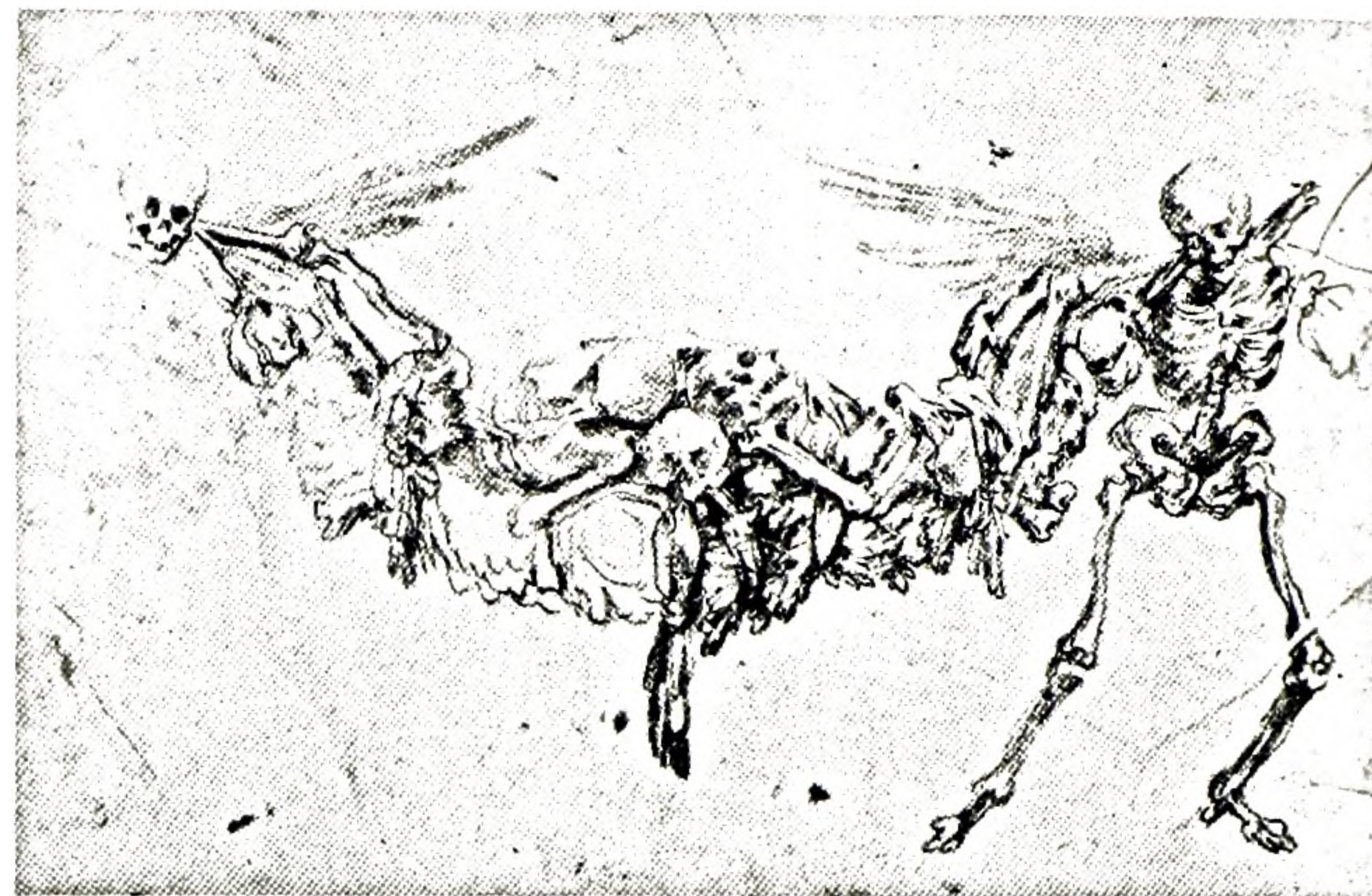
FIGURE 7. A. Watteau, Skeletal Figures , ca. 1720. Stockholm, Nationalmuseum.

Homo compositions. These two iconographies are further linked by the universality of their themes and their tragic implications.