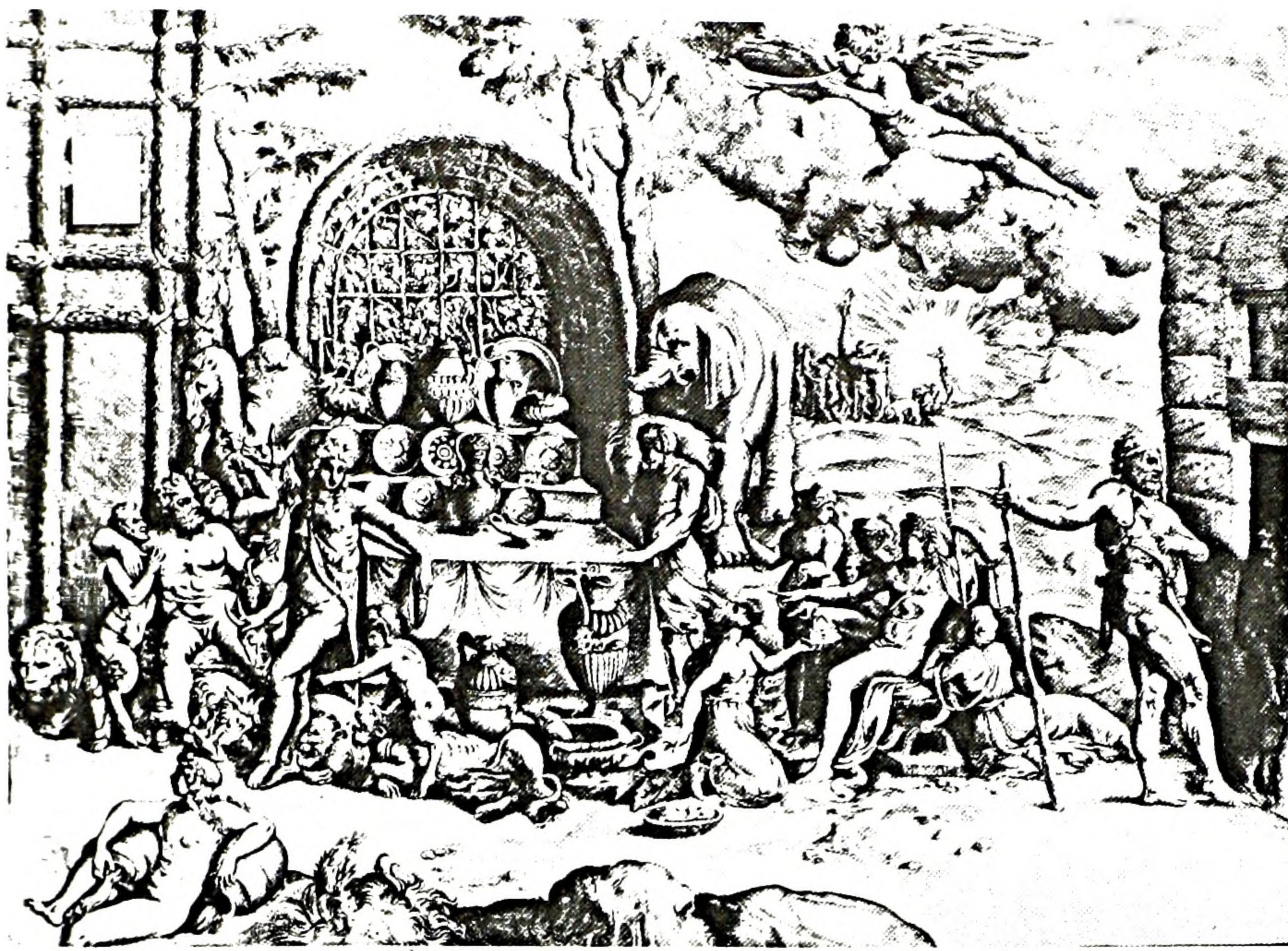
FIGURE 1. Giovanni Battista Franco, Scenes from the Sala di Psiche in the Palazzo del Te in Mantua (Bartsch xvi, 133, 47).

woodcuts of portraits of each artist, 3 one is inclined to ask whether the frequent references to prints may have been suggestions to the reader to create an illustrated version of the Vite . A collection of prints could accordingly have been considered as an acceptable substitute for drawings as means to document an artist's style. It should not be forgotten that Vasari himself collected drawings, which he mounted on large sheets with appropriate ornamentation to document the maniera of each artist. 4 A set of prints would fulfil the same function, at least in principle. Thus we may conclude that Vasari is asking the reader to look at the print while reading the Vite . As long as this junction were maintained, no question with regard to Vasari's reliability could be raised. Only if one overlooks Vasari's intention by replacing the combination of print and text with a comparison of the text and the actual object (i.e. when, instead of considering the print as an illustration of the artist's style, it is conceived as a correct description of the object itself), can one come to question Vasari's reliability. However, such a verdict is based on an assumption different from the one which guided Vasari when he wrote the Vite .