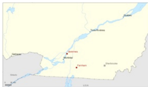
Figure 1. Map of Xyleborinus attenuatus records in Quebec, Canada (gray square – previous record; red circle – new records).

As a result of the 3-yr trapping survey of alien bark beetles, 16 specimens of X. attenuatus were captured as follows: 9-V-2011: three specimens at Farnham