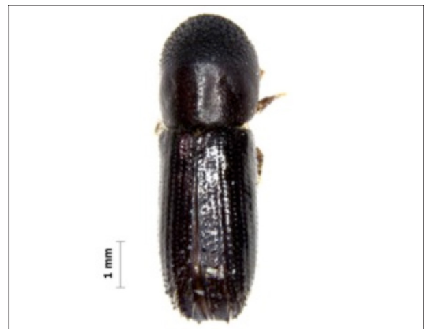
Figure 5. Xyleborinus attenuatus – dorsal view.