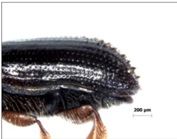
Figure 4. Xyleborinus attenuatus – lateral view of elytral declivity.