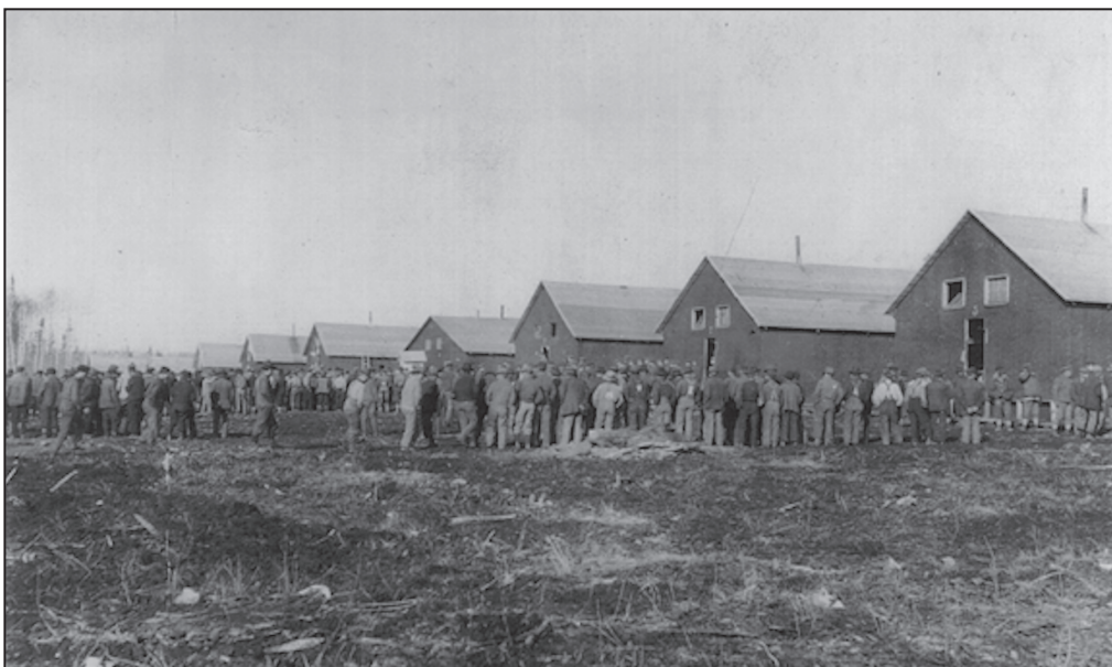
Prisoners assembling, Kapuskasing Internment Camp.

brought to the level of the Hun,” he declared. 15 But the director also understood that in the wilderness, there was little he could do if immediate and proper supervision was lacking.