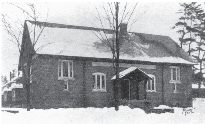
Fig. 3 Simcoe Carnegie library, c.1913 ( Rpt. of Min. of Education )

ment. The Stayner Institute branch [218] set aside two rooms for a library in its own frame building.