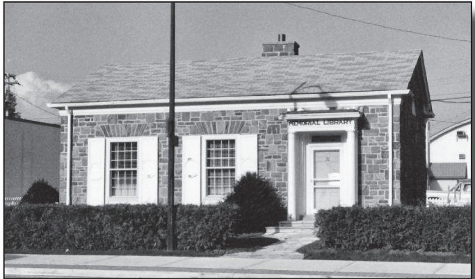
Fig. 2 Colwater Public Library, 1980