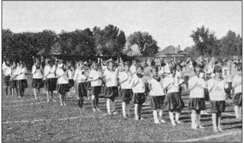
Figure 2: End of the year track and field meet at Tecumseh Park. Public Utilities Commission, 46th Annual Report (London, Ontario, 1924), 57.