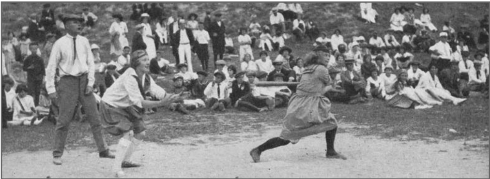
Figure 1: Girls' softball game 1921. Public Utilities Commission, 44th Annual Report (London, Ontario, 1922), 3. 51