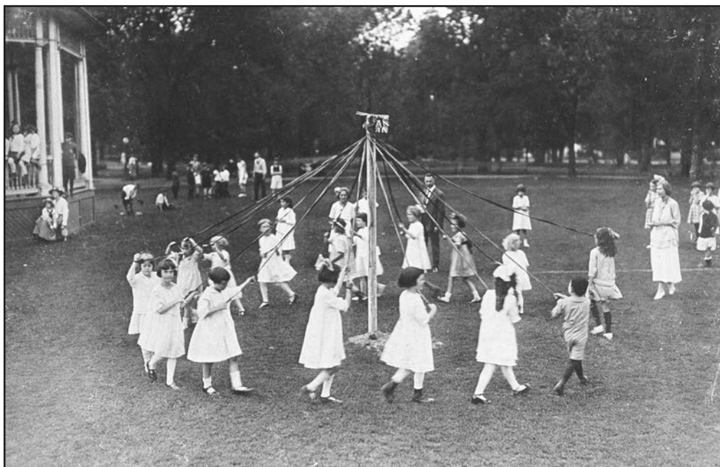
Figure 3: Maypole Dance, circa 1920, PUC Collection, The University of Western Ontario Archives, RC42067.

batt Park. 80 As an alternative source of revenue for the park, the women's league was welcomed as a fruitful replacement to circumvent the effects of the Second World War that led to the diminishment of the men's leagues. The inaugural league consisted of four teams, each one representing a ward of the city: The Shamrocks from the Southeast, The Cardinals from the Northwest, the Eagles in the South, and the Royals in the East. Many of the women interviewed for this study went on to play for one of these city teams.