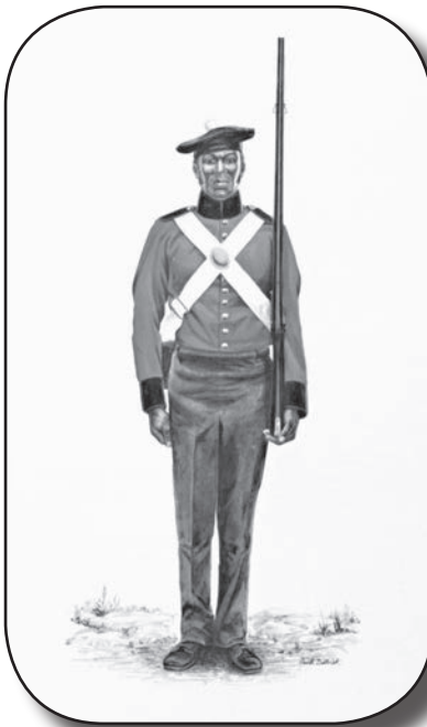
Figure 4: Standard uniform of the Upper Canadian Militia during the Rebellion period.

Once enlisted, the men would be equipped with a uniform, accoutrements and a smooth bore muzzle loading musket. 60 The new recruits were drilled in a simplified version of the standard Brit-