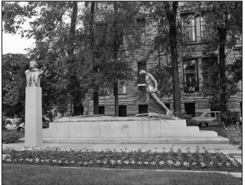
William Lyon Mackenzie Memorial in Queen's Park.

tute as Mackenzie King could seize upon. To mark each of these four phases—heroic revisionism, rehabilitative consensus, suppression of opposition material, reconfiguration of popular historical narrative—I have selected a representative,