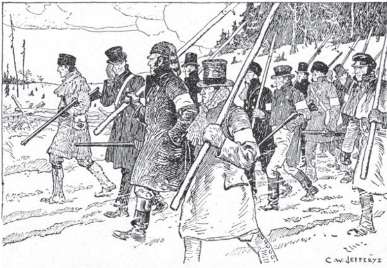
“Rebels marching down Yonge Street to attack Toronto, December 1837” by C.W. Jefferys, The Picture Gallery of Canadian History, Vol. 3, 1830-1900 (Toronto: Ryerson Press, 1950), 23.