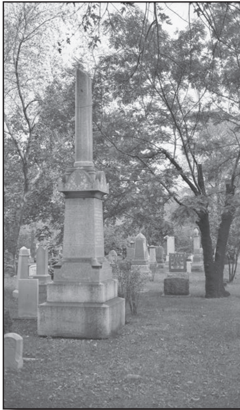
Necropolis Memorial.