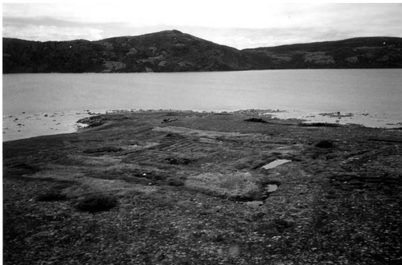
Figure 4. Aerial view of York Fort facing west, taken in 2000.

a stone bridge to a gate on the western side of the outer stockade, and thence descends the bluff to the water's edge, where is a stone pier for vessels. Just inside the gate are the walls of a block-house eighteen feet square. The whole fortification is surrounded by an irregular gravel walk. Some portions of the stockade were standing twenty years since, and the butts of many of the spruce pickets are still visible above the earth-works, but so rotten as to crumble at the touch. The whole place is overgrown with grass, moss, and juniper bushes. 21