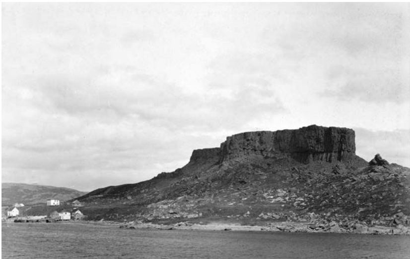
Figure 5. Photographer William Notman's 1909 image of "the Devil's Table" on Henley Island, Chateau Bay. (Library and Archives Canada, Acc. No. 1960-102)

Like other harbours in southern Labrador, Chateau Bay has a long history of human occupation dating to the earliest period of human settlement in the Northeast, around 8,000–9,000 years ago. Few harbours, however, share its exceptionally rich history, tied to the span of European exploration of the North Atlantic, to seafaring, centuries of fisheries, and eventual colonization. The discovery of the sketch of York Fort is a fitting venue for an overview of the history of the place where the fort was built, and fills a gap in the historiography of southern Labrador.