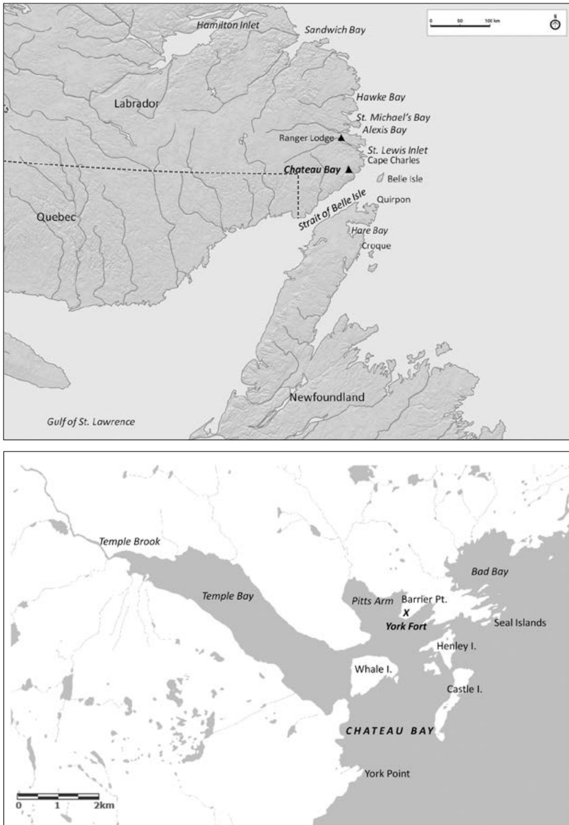
Figure 1. Chateau Bay and the Strait of Belle Isle region. (Base maps adapted from GeoGratis, http://geogratis.gc.ca/geogratis/search?lang=en )