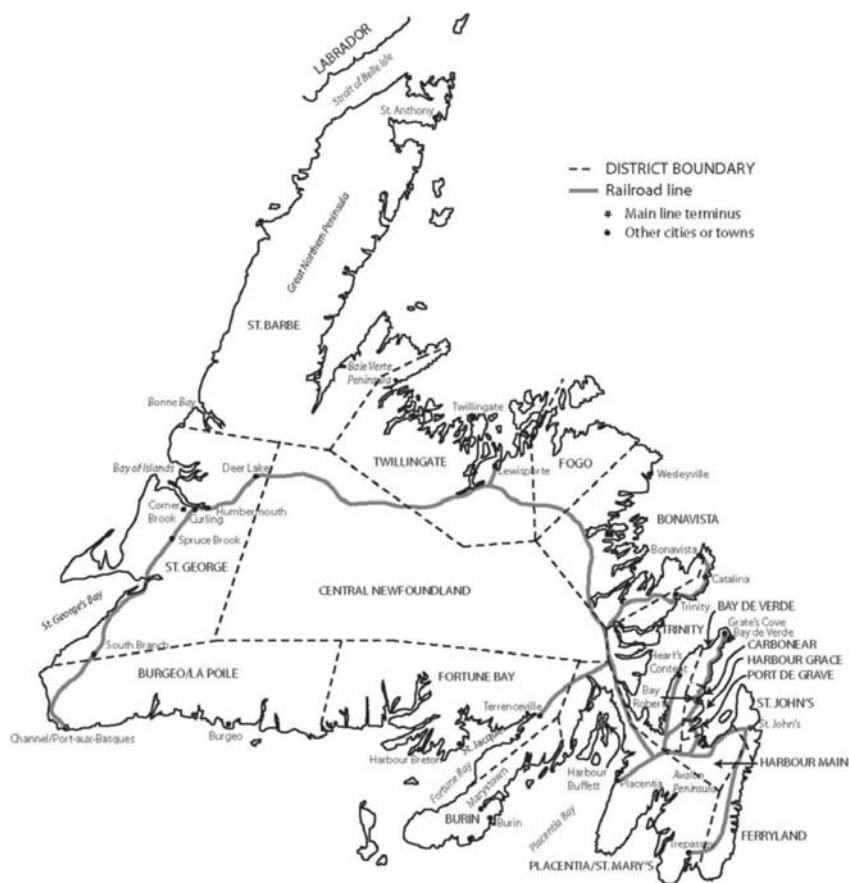
Figure 1. Map of Newfoundland showing the administrative districts and major rail lines at the time of the Spanish Flu epidemic.