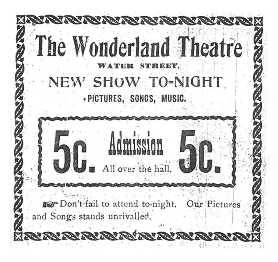
Figure 5. In St. John's, the movies were not located on downtown shopping streets. The Wonderland, later known as the Queen, was the only early picture show on Water Street ( Daily News , 7 December 1908).

shows doubly domesticated in St. John's, a good context for local authorities to balance regulation with a degree of parochialism.