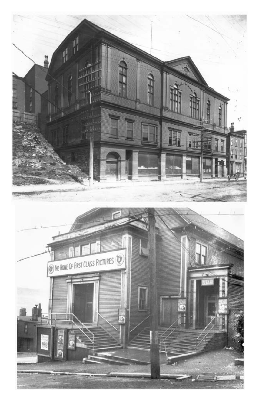
Figures 3 and 4. Early in September 1907 two more picture shows opened, in the Total Abstinence [TA] Hall and the Star of the Sea Hall (shown here as rebuilt later). Photos courtesy of the Centre for Newfoundland Studies Archives, Collection 137, items 2.04.013 and 2.04.020.