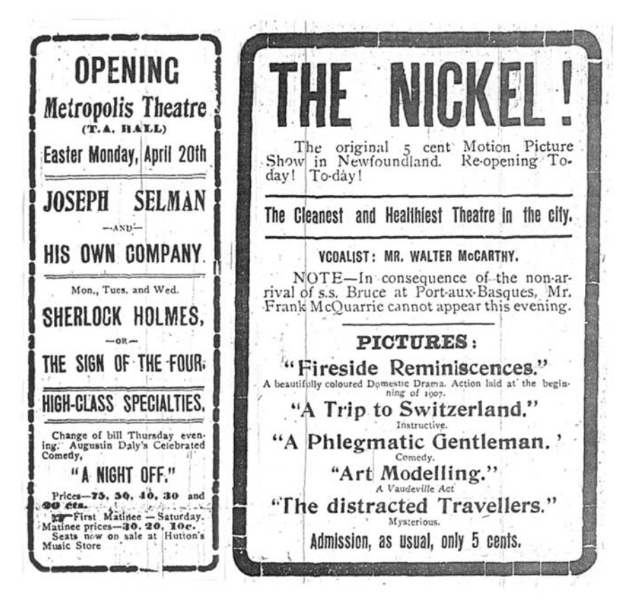
Figure 7. For over a decade, most St. John's theatres closed for Holy Week and had grand re-opening shows on Easter Monday ( Daily News , 20 April 1908).

best families," while the Star that same day announced "This popular theatre will be closed during the Lenten Season."<sup>52</sup> Perhaps struggling with a drop in attendance during Lent, the Nickel spelled out its case inside of its advertising: "Don't forget that this theatre is sterilized twice weekly, therefore perfectly clean; it is steamheated, well ventilated and in every way the most up-to-date playhouse in the city."<sup>53</sup> The Nickel, in particular, was savvy (or simply fortunate) to present the worldwide phenomenon of an elaborate film of The Passion Play in February 1908 just before Lent. The Daily News reported about the first showing that "in the audience was a representative gathering of clergymen, who express[ed] to the management their great surprise at the excellence of the subject dealt with."<sup>54</sup> The same films of the Passion Play had for the previous months played to much the same acclaim and pious hype all over North America. It had prompted several theatoriums in Toronto to advertise for the first time in September 1907.