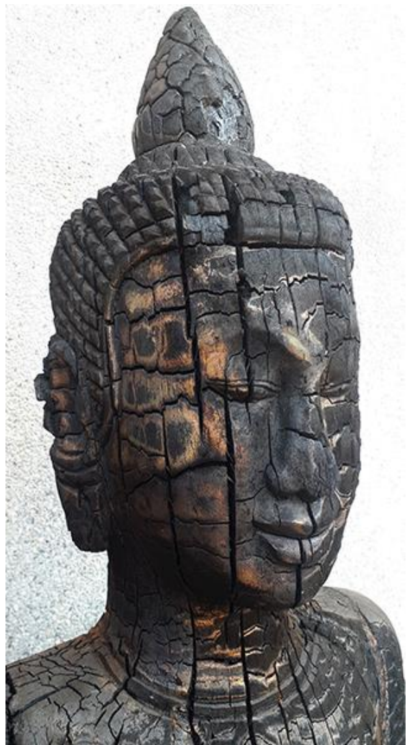
Charred Bodhisattva, Phnom Penh, Cambodia, Feb. 2020

Perhaps the tropes of Gaia and the Anthropocene are casualties of our fixation with auto-poiesis--self-making—and these conceits are running their course. In Staying with the Trouble: Making Kin in the Chthulucene , Donna Haraway instead suggests we embrace sym-poiesis—or making-with. Humans may believe they have created the world with their Technique, communications, art, science and philosophy, when in fact the world as we know it is a “making-with” nature, a collaboration straining for equilibrium. We forget who and what we are cohabiting with at our peril.