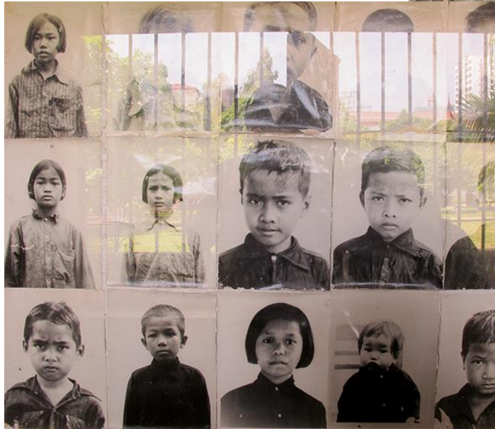
Children Executed in Tuo Sleng School (Museum of Genocidal Claims) Phnom Penh, Cambodia, February 2020