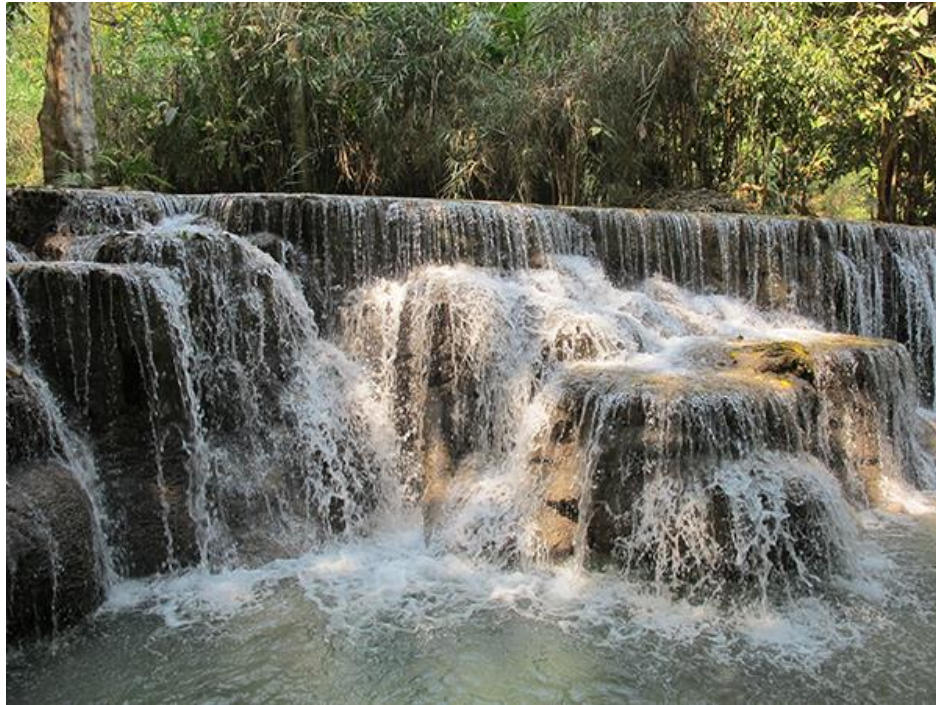
Kung Si Waterfall, Laos, Feb. 2020

Intolerable insolence, in the section called “Fractals on Surrender Row (A)” encourages “Necessary resistance: against a life without inspiration.” And later in this “Discarnate Rock Opera”: