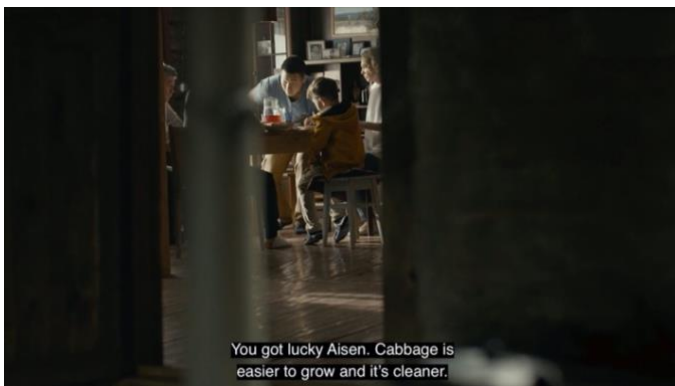
Figures 2 and 3. Barred framing in Ich-chi (Marsaan, 2021)