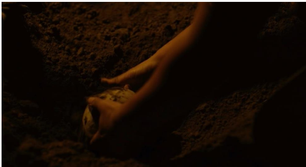
Figures 9 and 10. Ich-Chi (Marsaan, 2021)