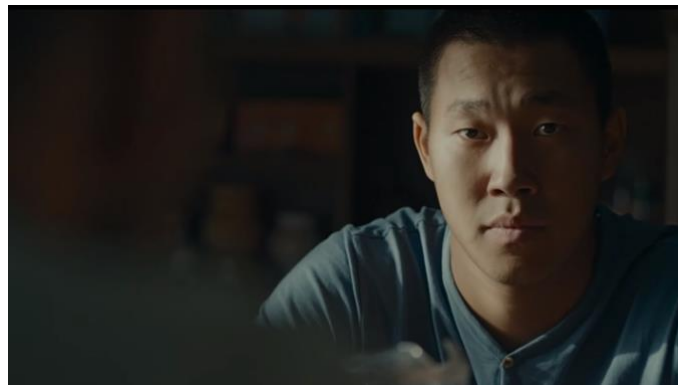
Figures 4 and 5. Aisen looking in Ich-chi (Marsaan, 2021)