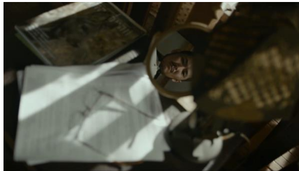
Figures 6 and 7. Ich-Chi (Marsaan, 2021)