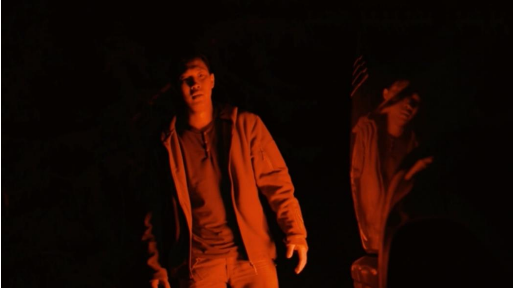
Figure 8. Ich-Chi (Marsaan, 2021)

Over the course of the film, the mirror as an object becomes increasingly uncanny. At the moment of realization that he has run over his brother, Aisen's image is mirrored in the car (figure 8).